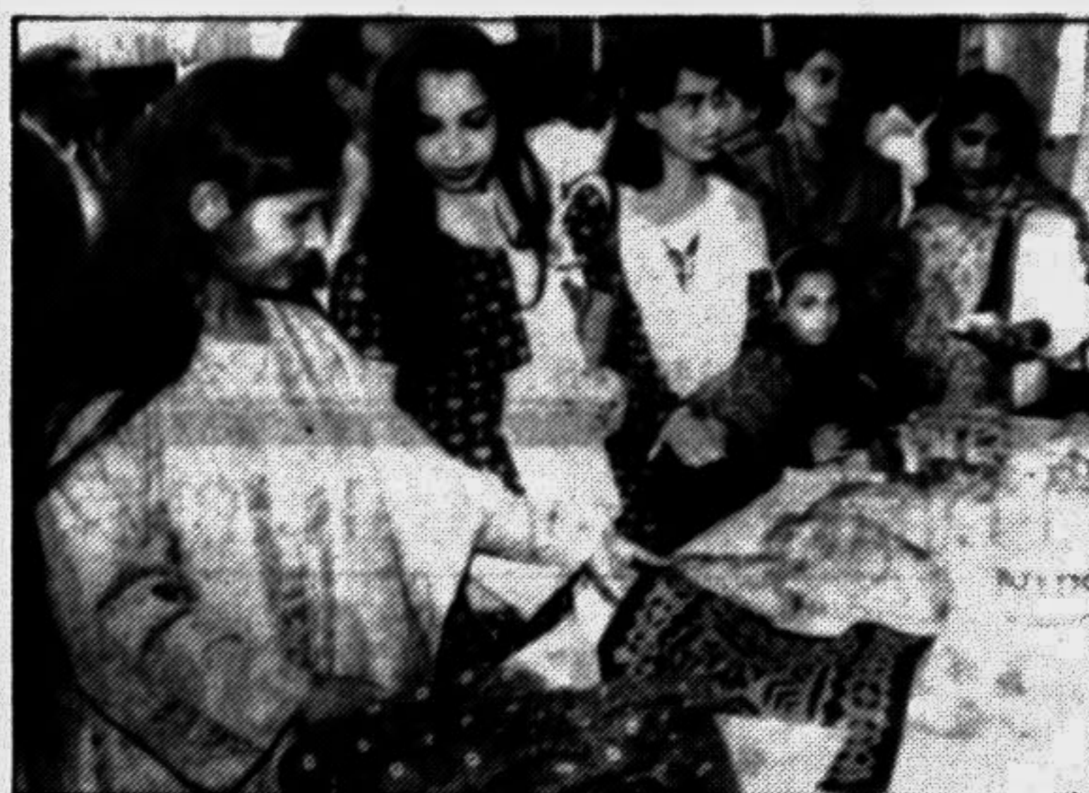
Visitors at the WVA meena bazar held at Gulshan Children's Park in the city yesterday.