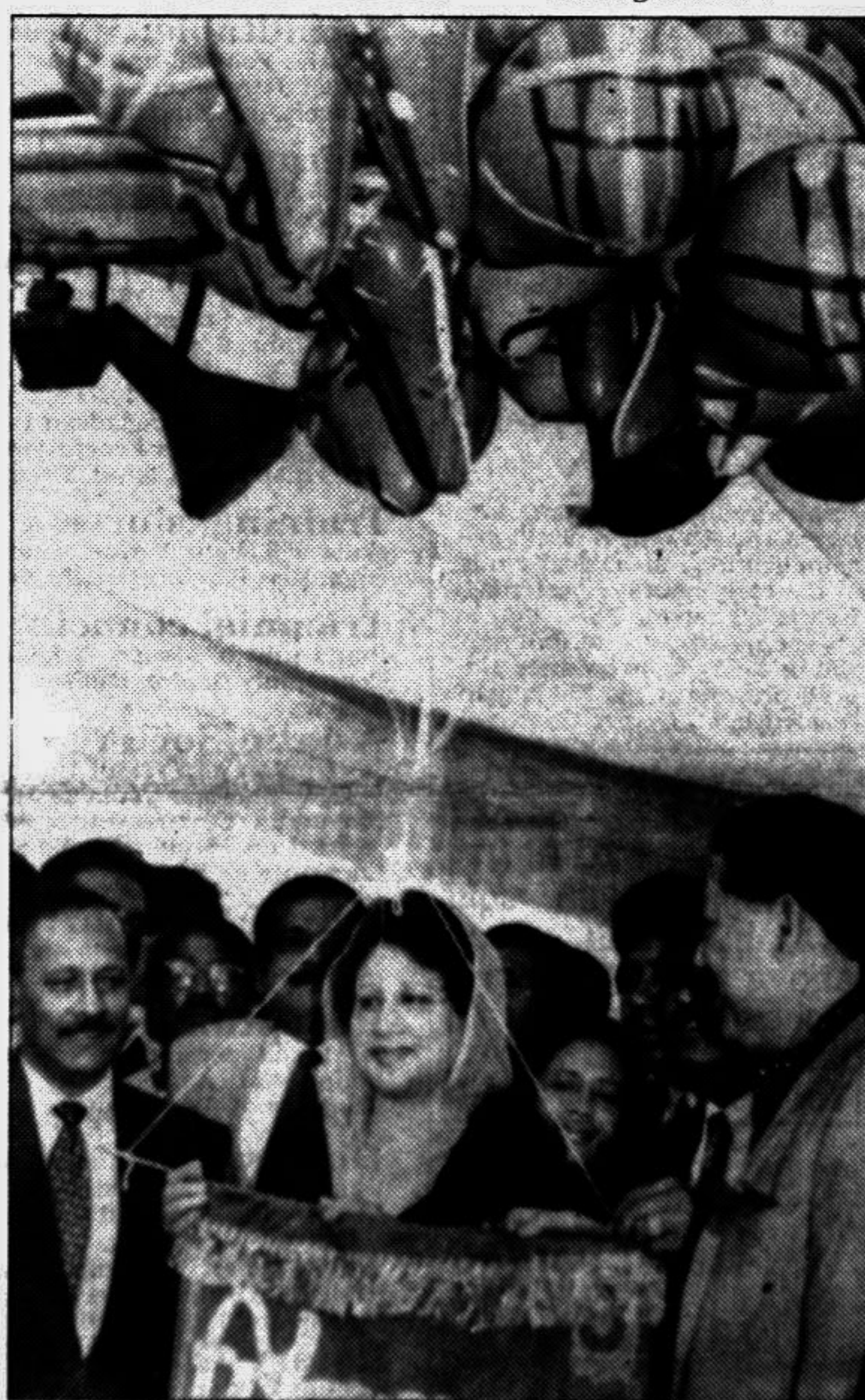
BNP Chairperson Begum Khaleda Zia releasing balloons during the inaugural ceremony of the 'Bijoy Mela' organised by JASAS at the Ramna Park in the city yesterday.