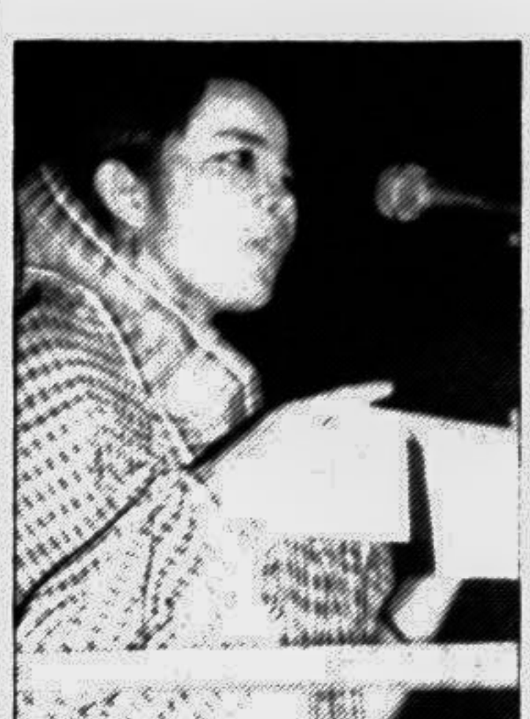
A scene of the 'public hearing' at the Bakultala of DU's Fine Arts Institute yesterday.