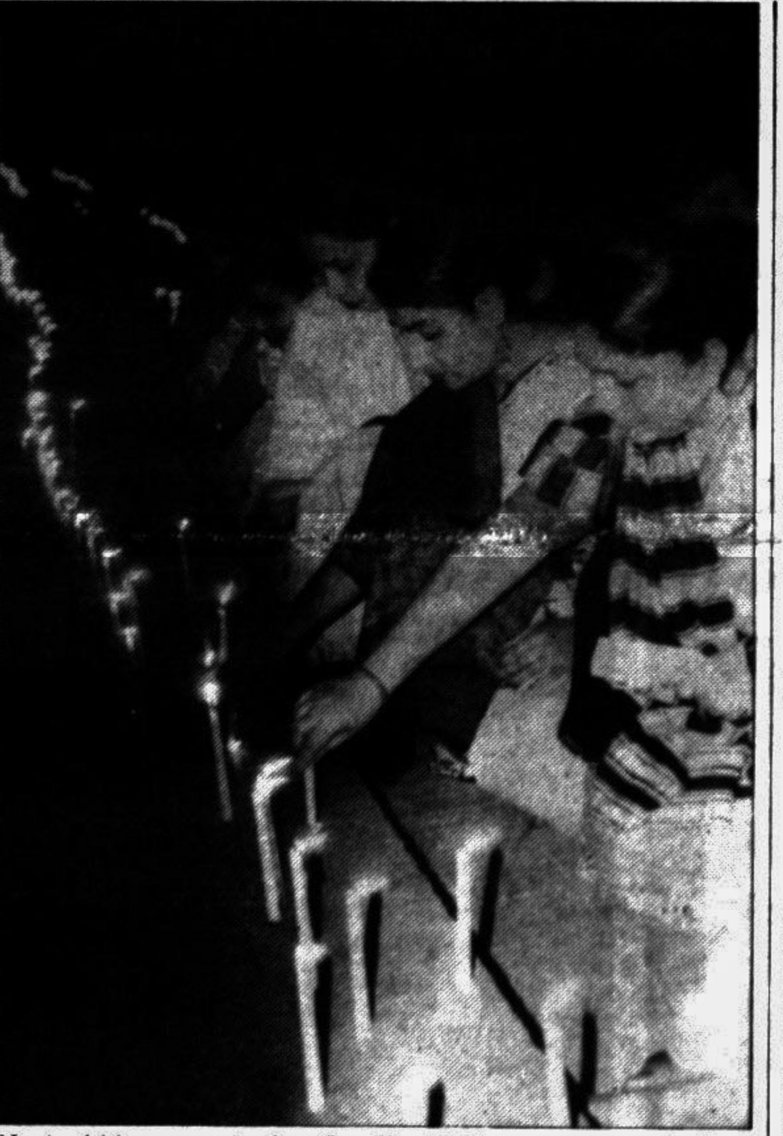
Naripakkha organised a Candle Light programme at the Central Shaheed Minar in the city yesterday in memory of the martyrs of Liberation War.

By Staff Correspondent A 'public hearing' on the incidents of rape and killing by the Pakistani occupation forces, Razakars, Al-Badr and Al-Shams during the Liberation War will be held at the 'bakultola' of the Fine Arts Institute of Dhaka University today in observance of the Victory Day. Organised by Sammito Nari Samaj, the 'public hearing' will begin at 7:30 pm. Meanwhile, as the Victory Day approaches, the capital city is taking a festive mood with more and more socio-cultural and political organisations organising various programmes. See Page 12 Col 5