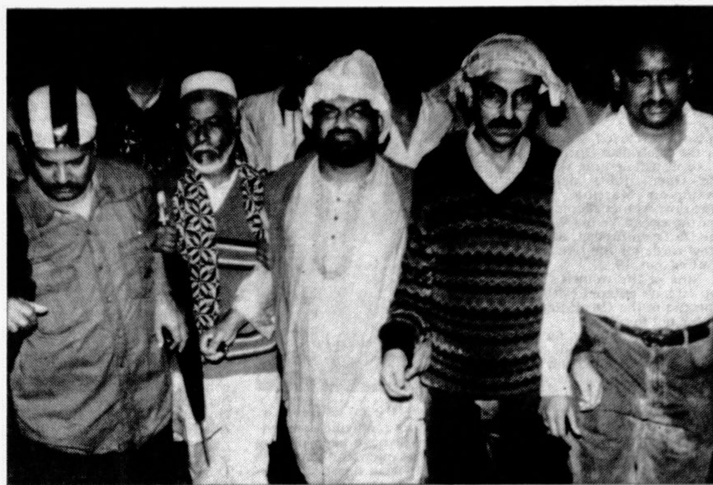
A BNP procession at Nayabazar in the city yesterday protesting the CHT accord.

Meanwhile, the University authorities have postponed all the examinations scheduled for tomorrow due to unavoidable circumstances.