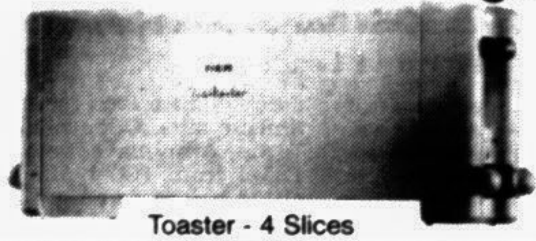
Toaster - 4 Slices