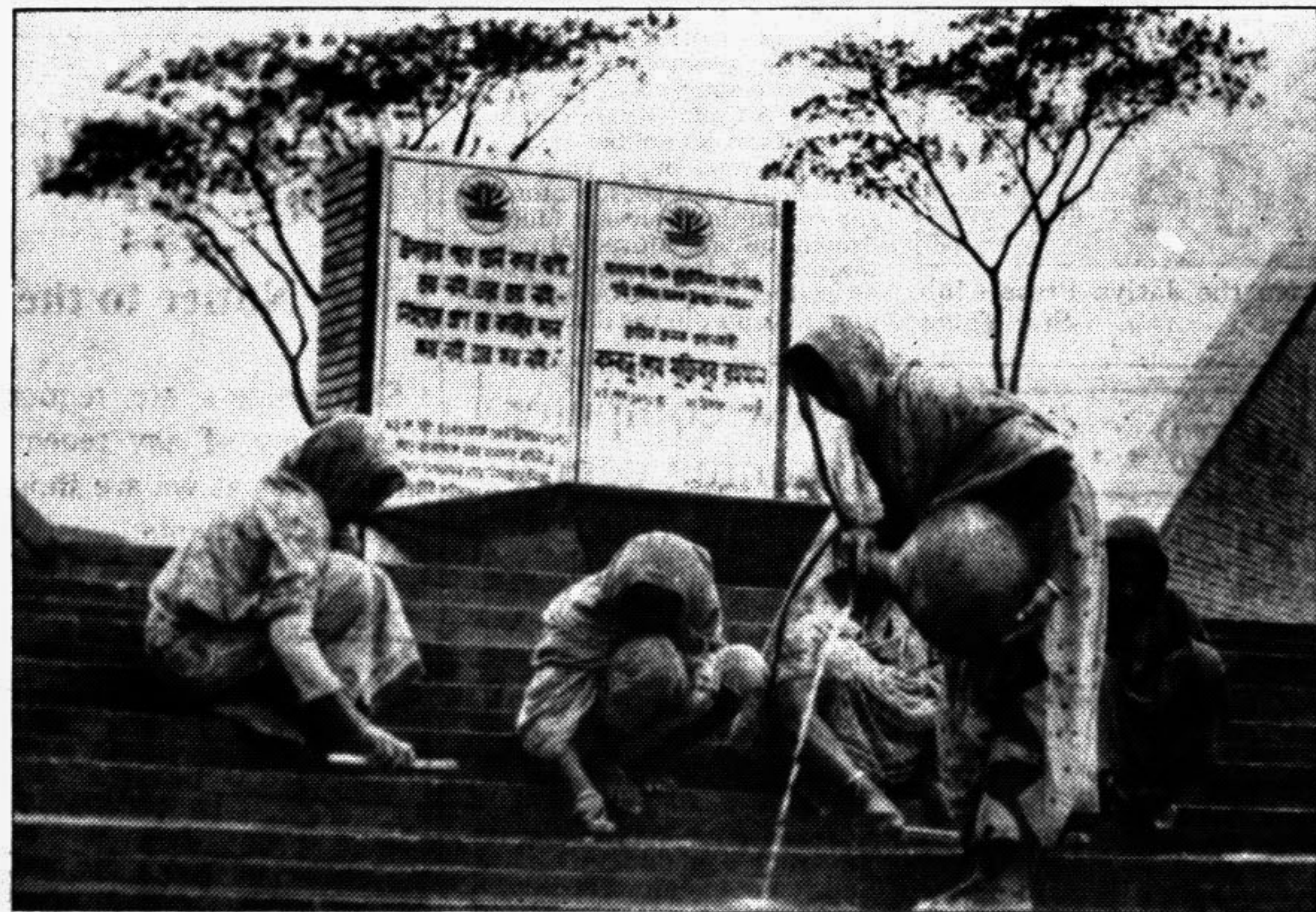
The memorial at Mirpur being spruced up as the Martyred Intellectuals Day is only three days away.