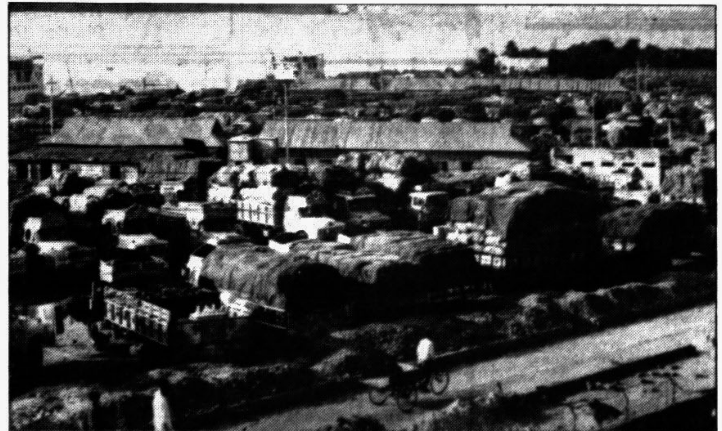
Trucks often remain stranded at Aricha ghat waiting to be ferried across the Padma-Jamuna.