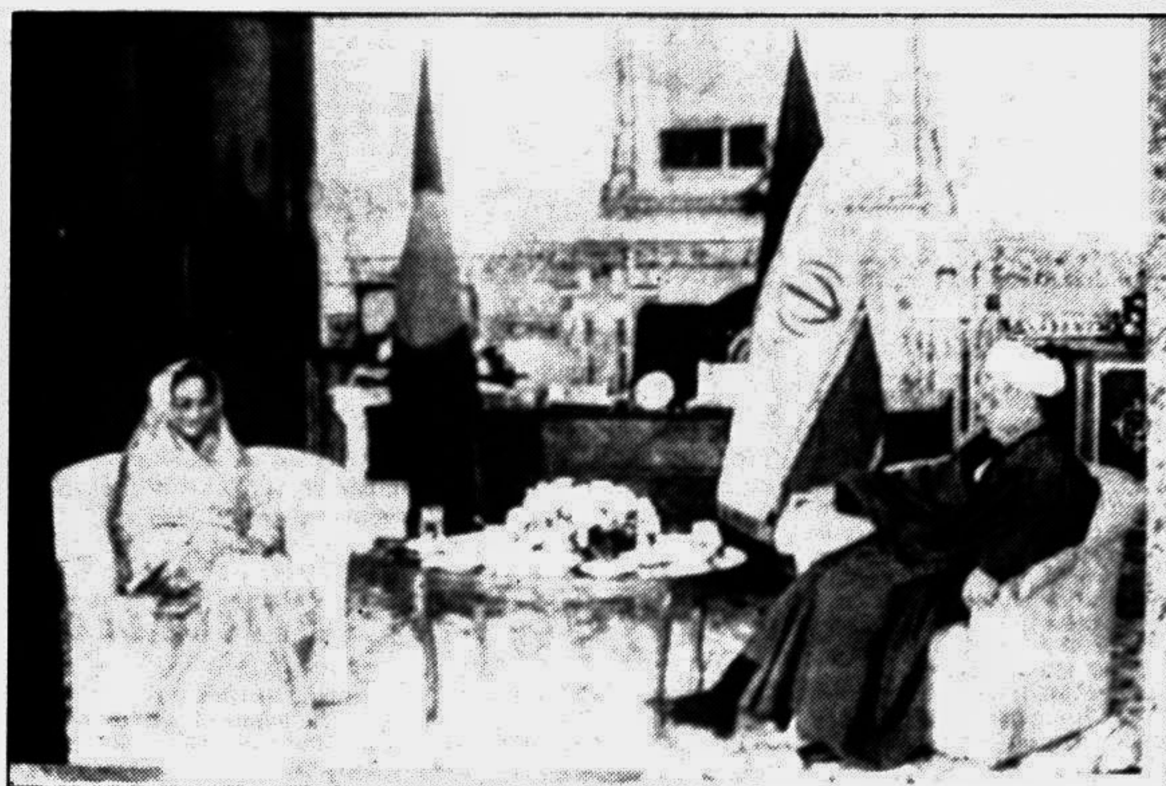
Prime Minister Sheikh Hasina called on former Iranian President Akbar Hashmi Rafsanjani in Tehran on Monday.

Published by the Editor from City Publishing House Ltd, 90 Kakrail, Dhaka-1000 on behalf of Mediaworld Ltd, 52 Motijheel C/A, Dhaka-1000. Editorial, News & Commercial Offices: House No: 11, Road No: 3, Dhanmandi R/A, Dhaka-1205. PABX: 500092-4, Commercial: 500091, Fax No: 88-02-863035, GPO Box No: 3257, Cable: DAILYSTAR, DHAKA. Internet address: http://www.dailystarnews.com and Email address: dstar@bangla.net