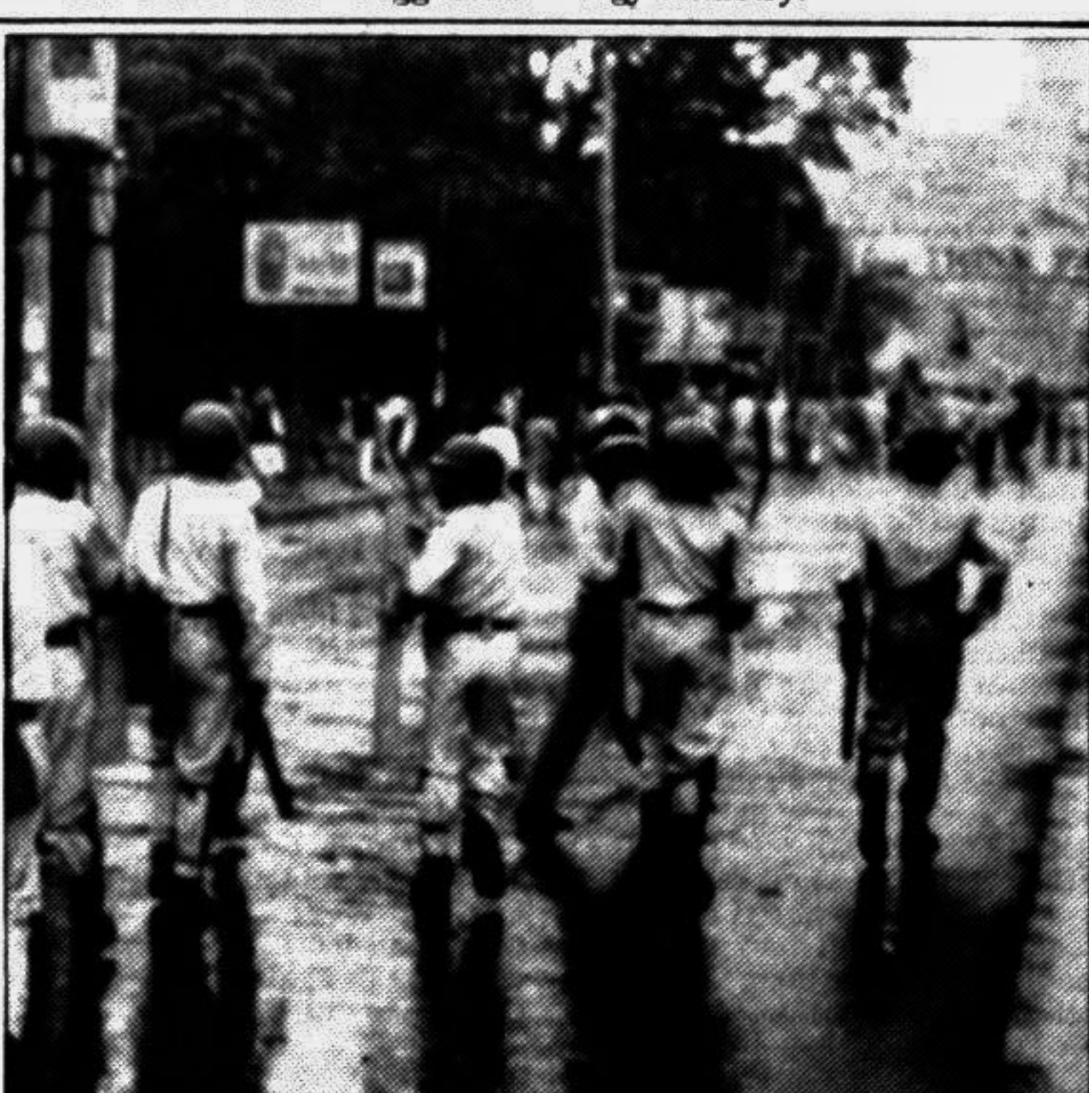
Police dispersed Zaker Party activists demonstrating against the CHT accord in the city yesterday.

"We had nothing to do with the restriction. It was the Prime Minister's Office who imposed the restriction. And again it was the same office who lifted it," said one official of the Energy Ministry.