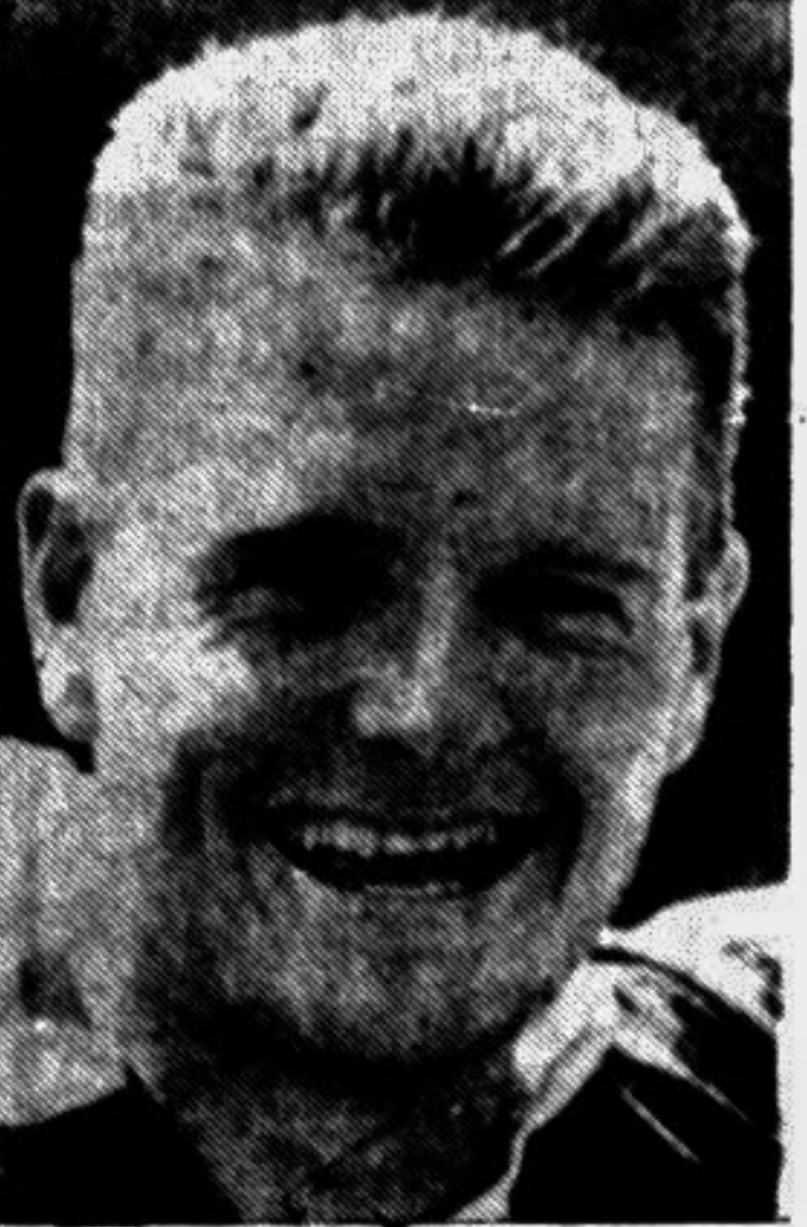
Paul Gascoigne (England soccer star) "In America, once you are famous they adore you for the rest of your life."