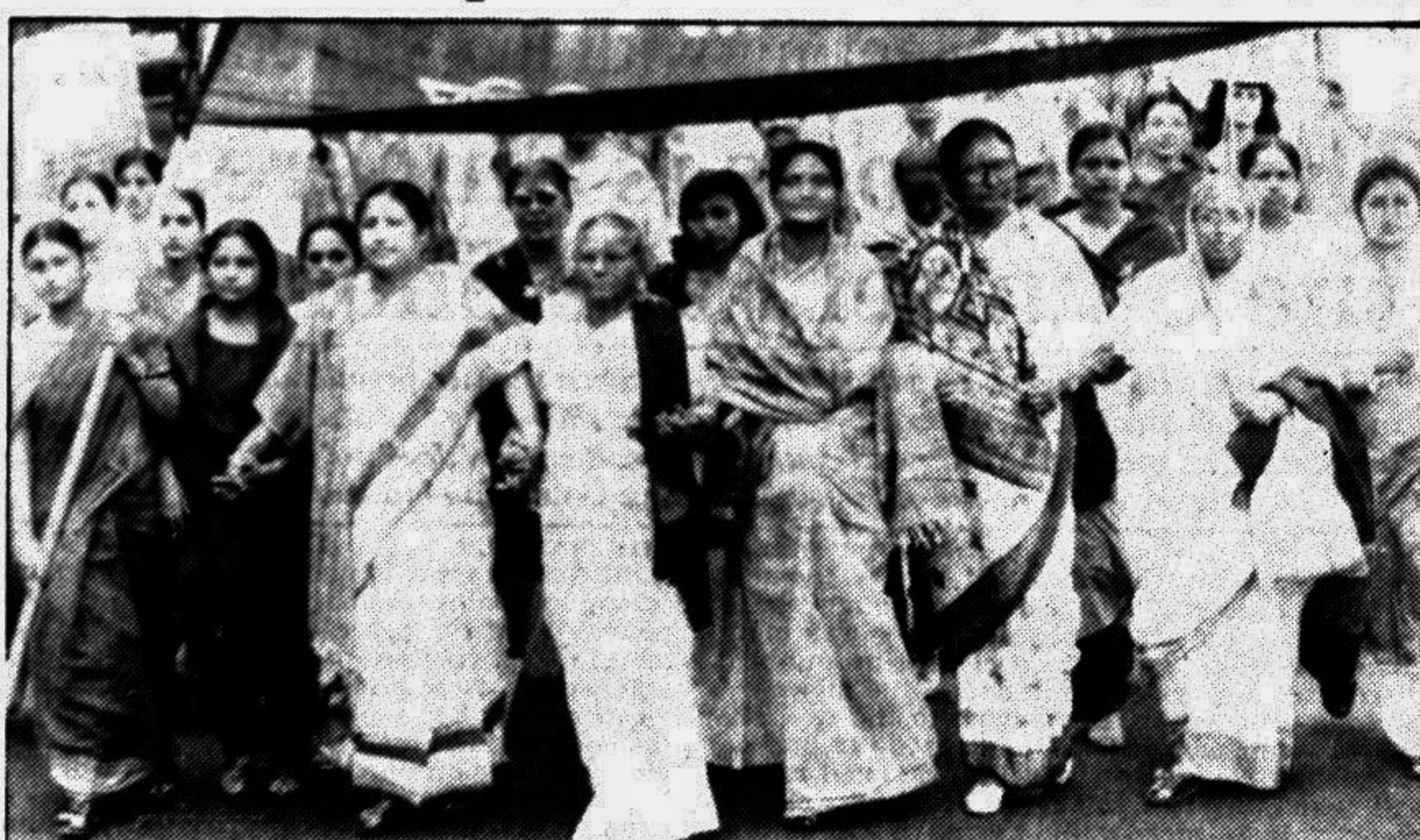
Sammilito Nari Samaj brought out a procession marking the Begum Rokeya Day in the city yesterday.

The reception will now be held on December 17 at 3:30 pm at the British Council.