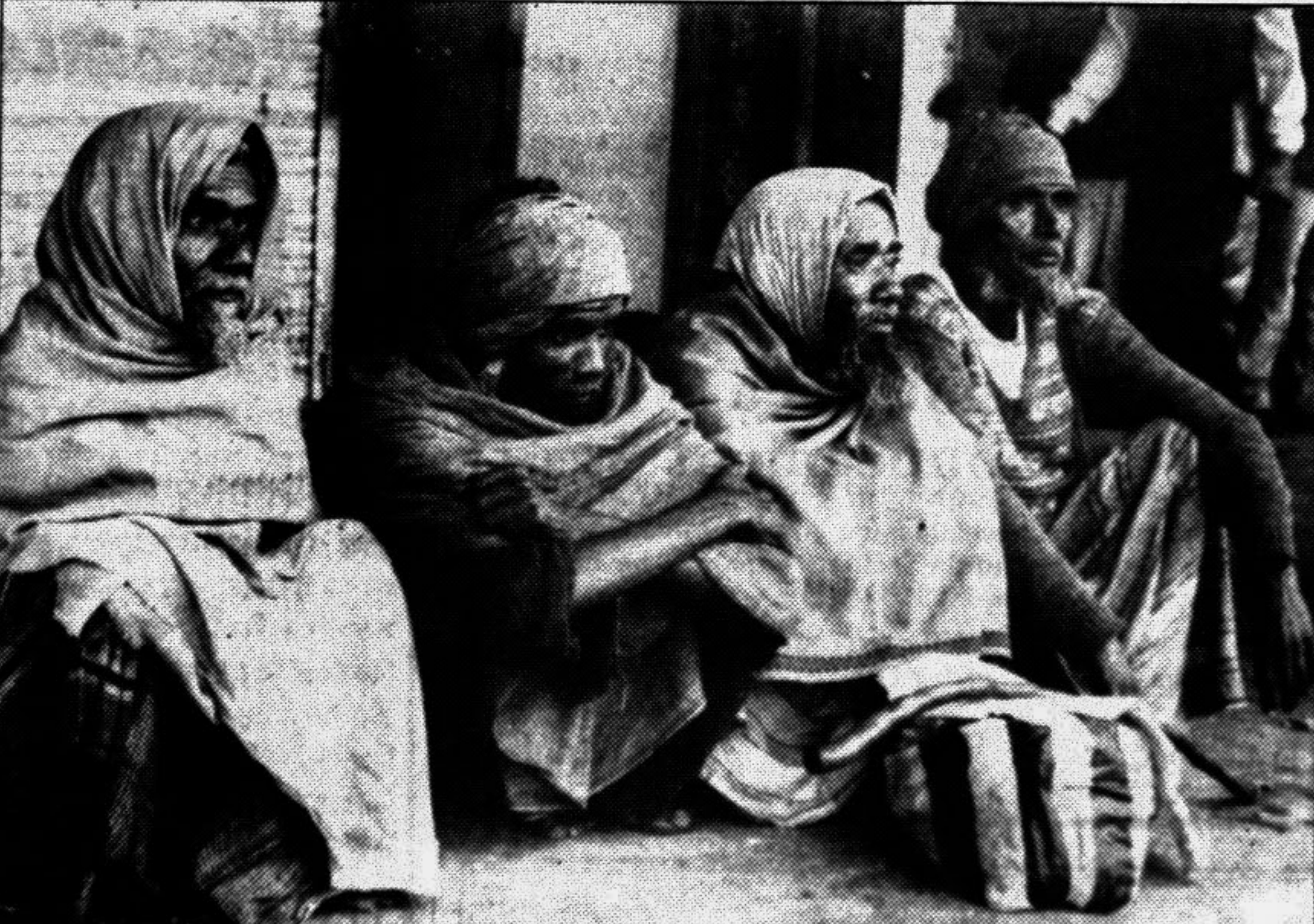
THE FIRST BITE OF THE WINTER: The quartet crouch at the verandah of the Mirpur Stadium, waiting for the drizzles to go yesterday.