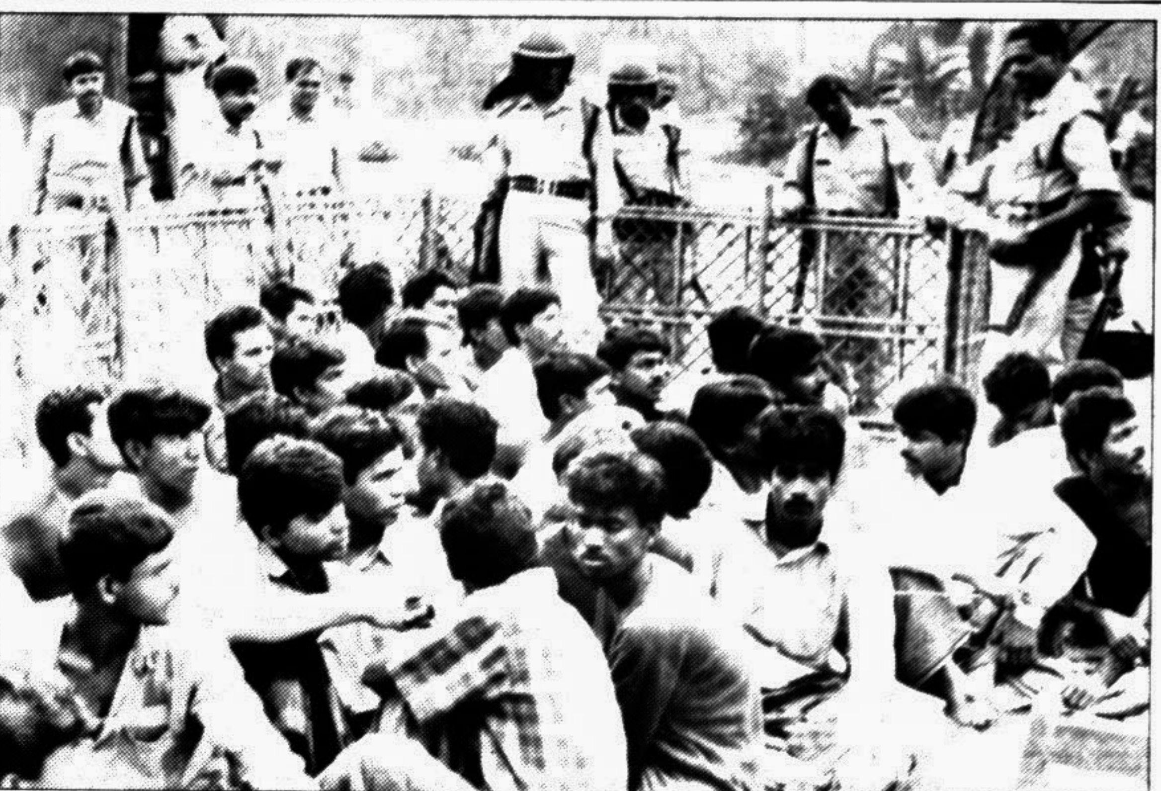
Those arrested for barricading Dhaka-Chittagong highway seen on the Sonargaon thana compound yesterday.