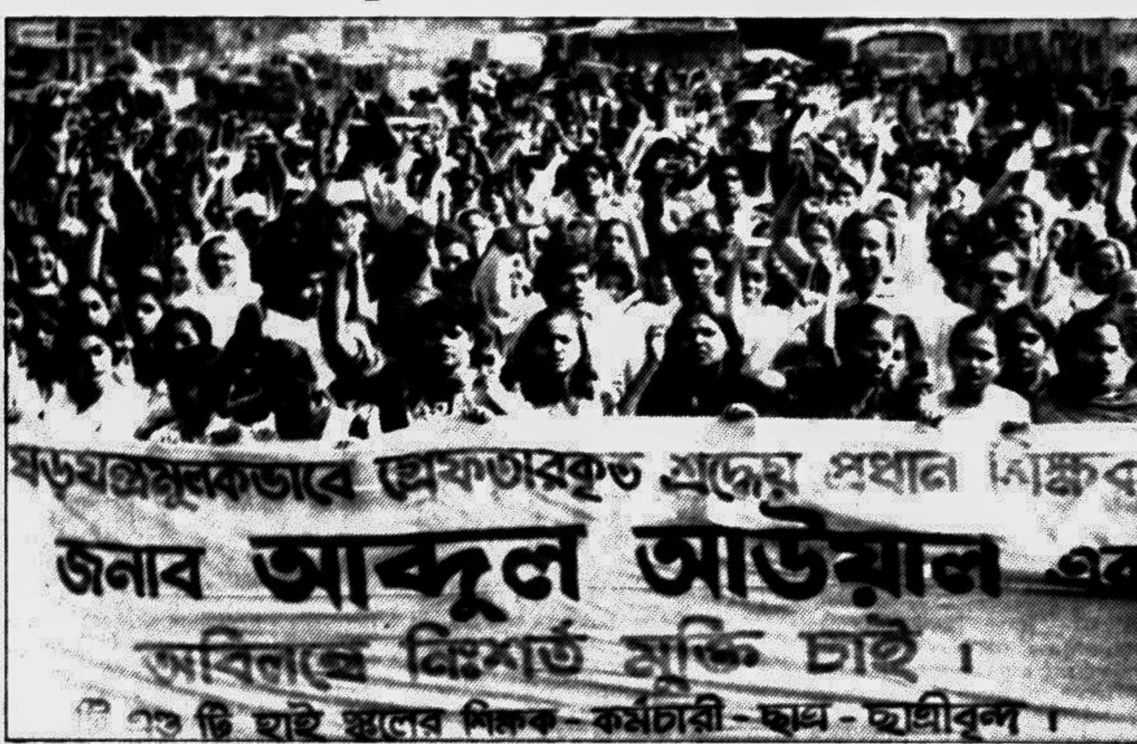
Students of Motijheel T and T High School and their guardians brought out a rally in the city yesterday demanding immediate release of the school's headmaster, who was arrested on Wednesday.