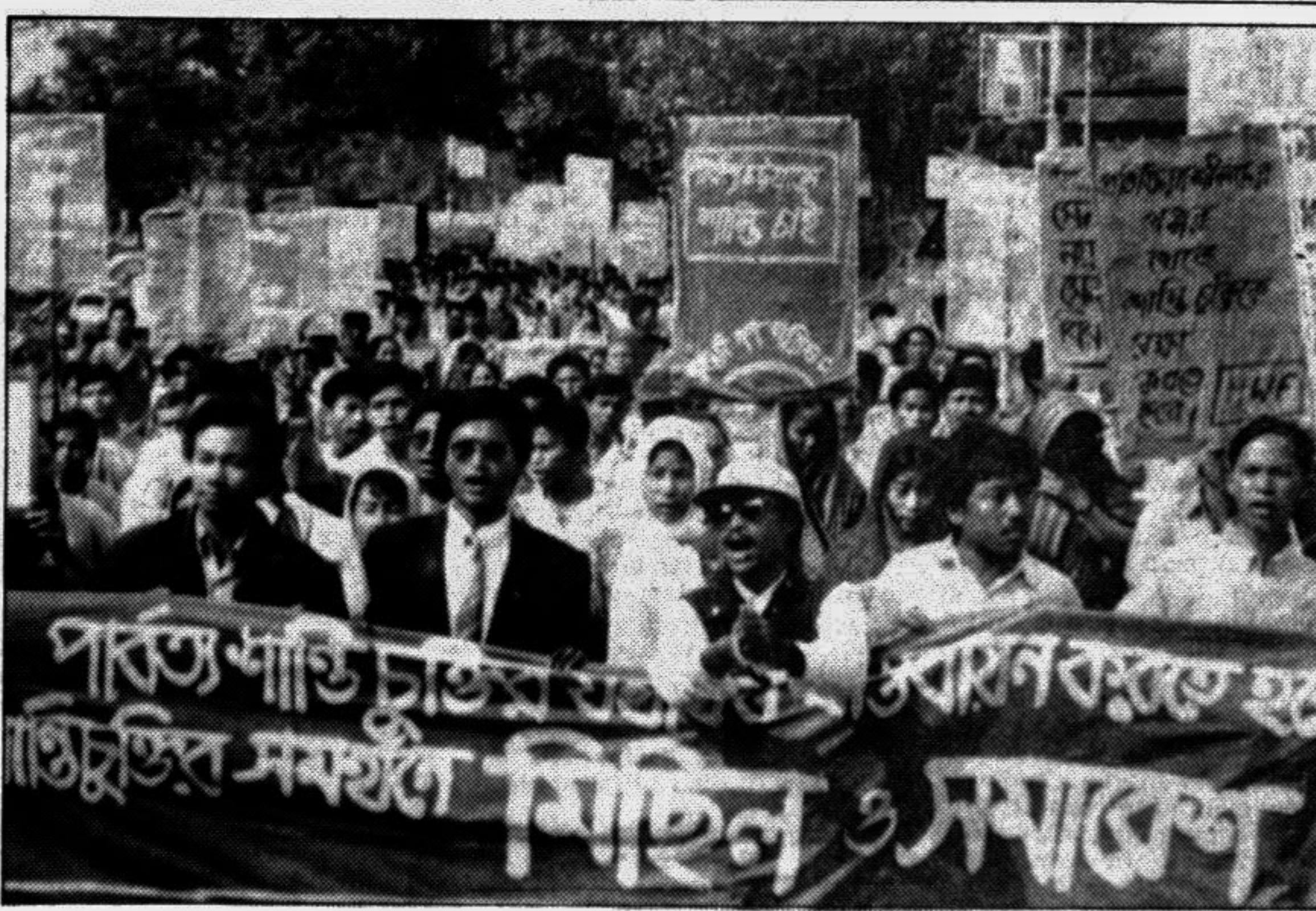
Pahari Gano Parishad, Hill Women's Federation and Pahari Chhatra Parishad, front organisations of PCJSS brought out a procession at Khagrachhari yesterday welcoming the CHT peace accord.