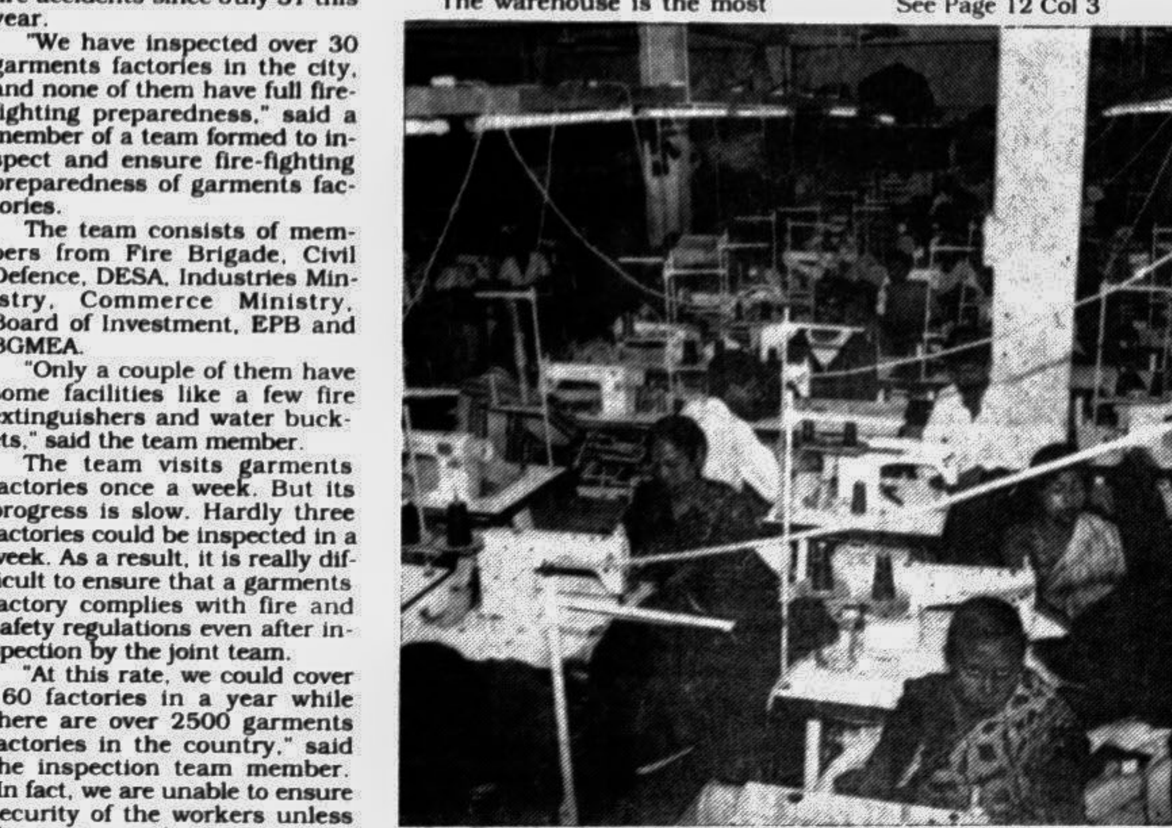
Normal scene in a city garments factory where the workers hardly have any safe passage to escape during an emergency.

Rampura, Mirpur and Kamalapur areas revealed that even three months after the BGMEA sent a notice to different garments factories, none took any fire-fighting measures. Meanwhile, at least 43 garments factory workers died in fire accidents since July 31 this year. "We have inspected over 30 garments factories in the city, and none of them have full fire-fighting preparedness," said a member of a team formed to inspect and ensure fire-fighting preparedness of garments factories. The team consists of members from Fire Brigade, Civil Defence, DESA, Industries Ministry, Commerce Ministry, Board of Investment, EPB and BGMEA. "Only a couple of them have some facilities like a few fire extinguishers and water buckets," said the team member. The team visits garments factories once a week. But its progress is slow. Hardly three factories could be inspected in a week. As a result, it is really difficult to ensure that a garments factory complies with fire and safety regulations even after inspection by the joint team. "At this rate, we could cover 160 factories in a year while there are over 2500 garments factories in the country," said the inspection team member. "In fact, we are unable to ensure security of the workers unless the owners volunteer to take measures against fire." Fire officials also pointed out that since most of the facto-