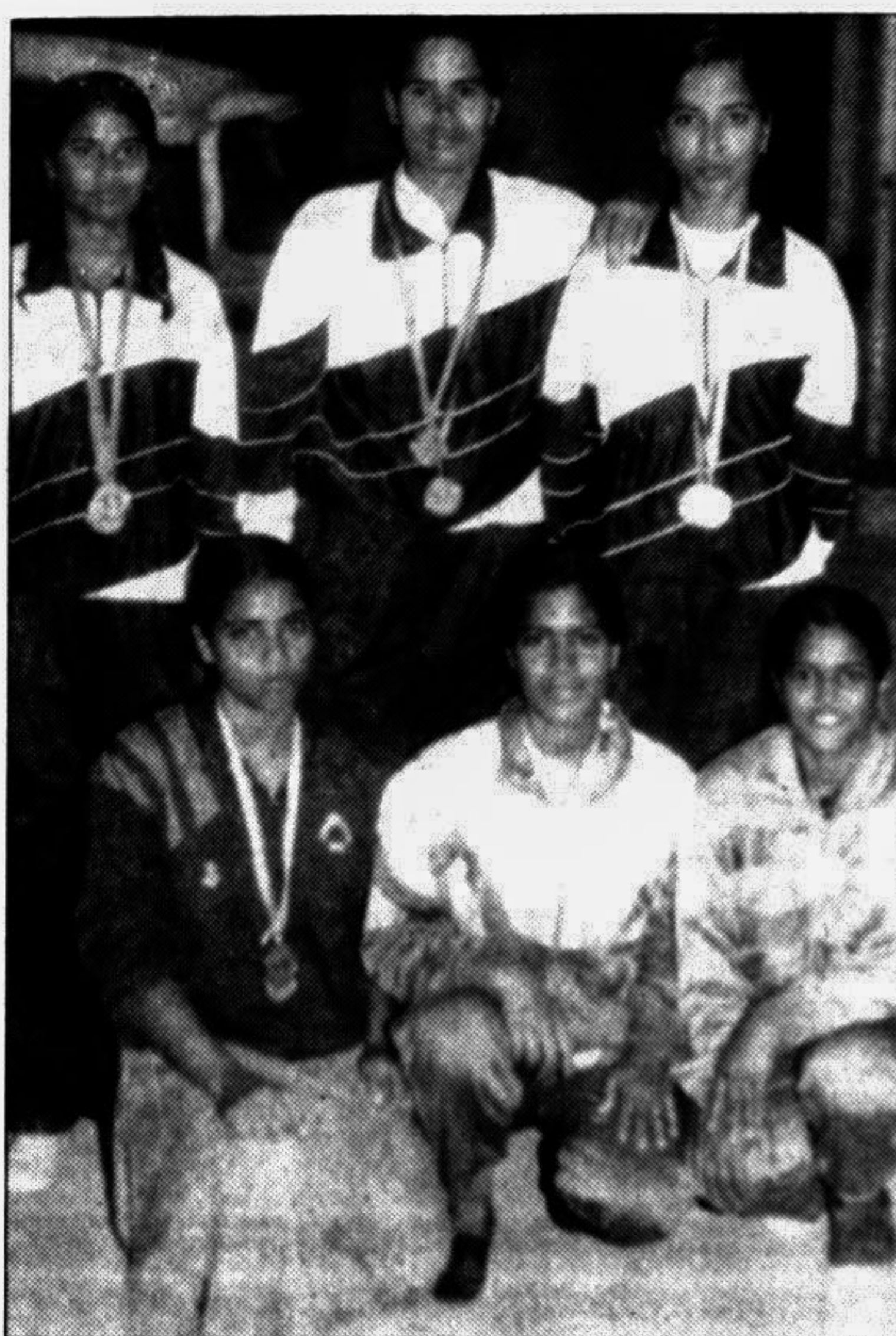
The Ansars and VDP team.

In another game, Dighalia YMA Club defeated Cosmos Club 2-0.