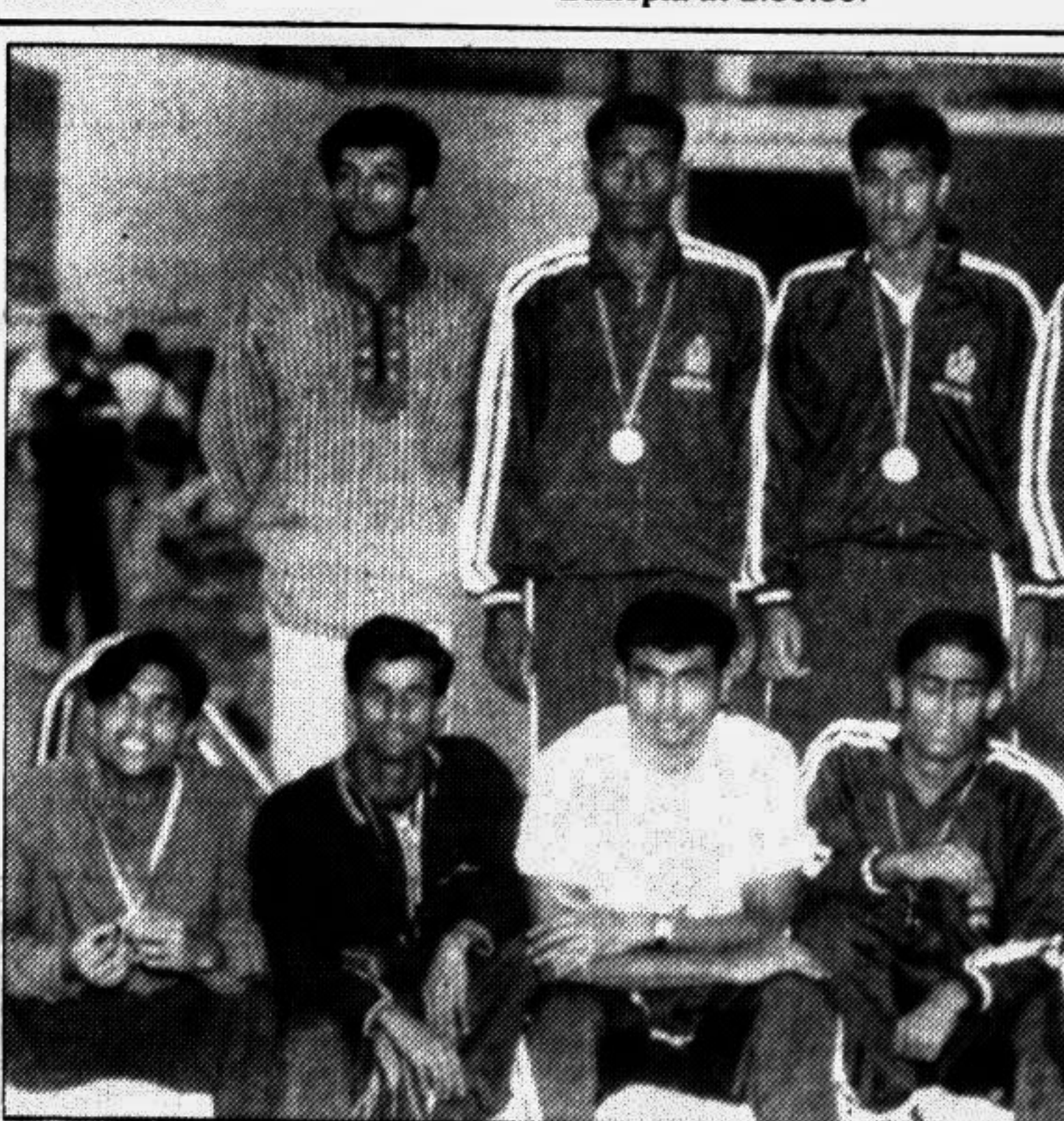
Members of the Navy team.