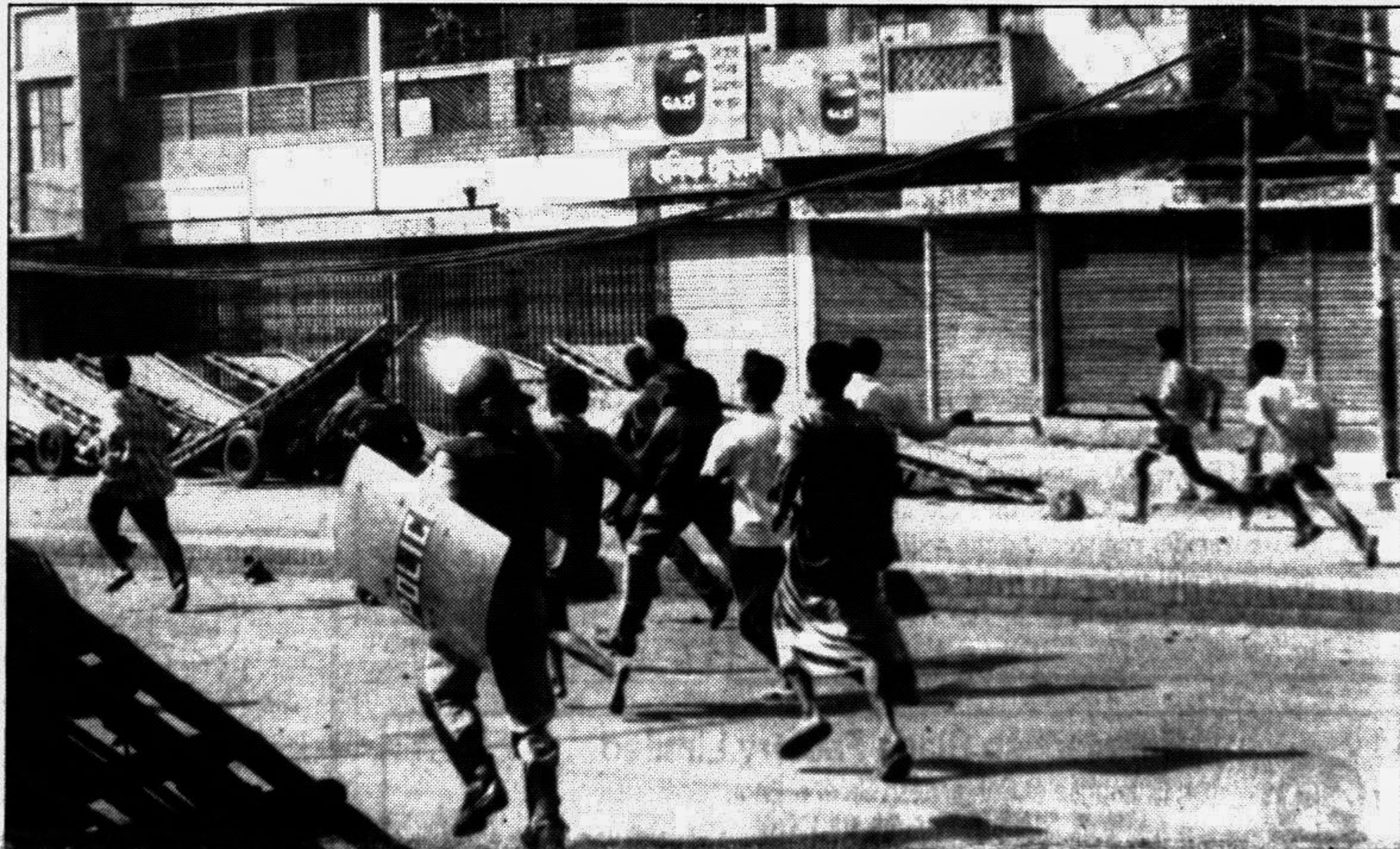
Anti-hartal activists chasing pickets on the city's North South Road during hartal hours yesterday.