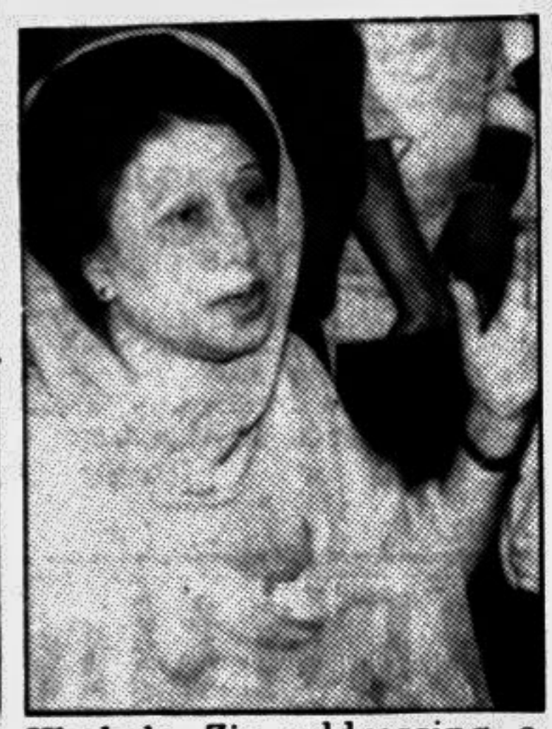
Khaleda Zia addressing a press conference in the city yesterday.