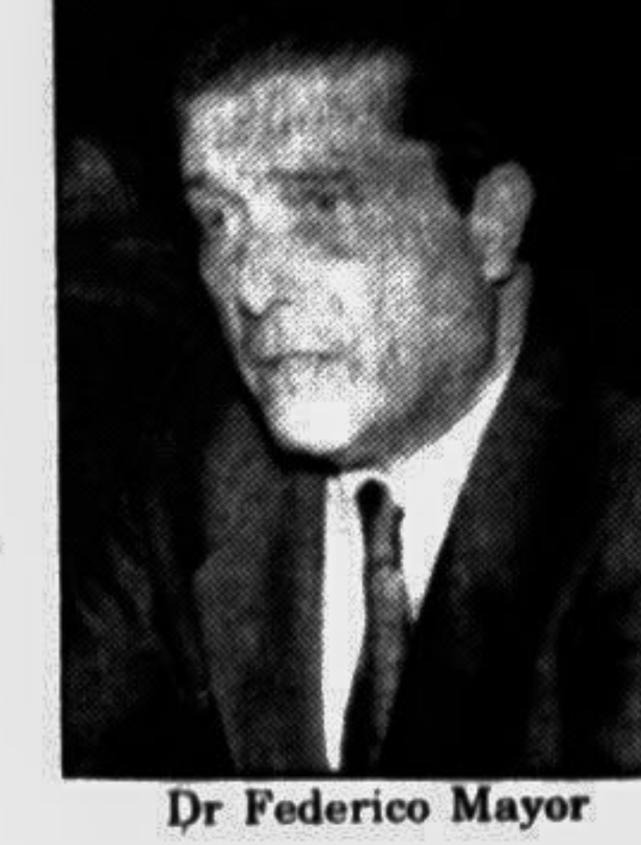
Dr Federico Mayor