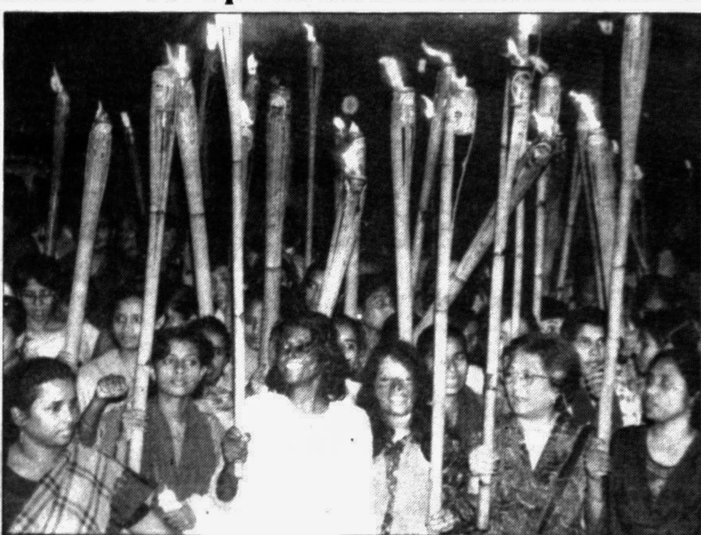
Naripakkho brought out a torch procession in the city yesterday on the occasion of International Women Repression Prevention Day.

The Constitution, therefore, expressly declares that any administrative unit including a "gram" must consist of "elected representatives." In this context, the word "elected" must mean free and fair election conducted by an independent authority such as the Election Commission, constituted under Chapter VII of the Constitution, he said.