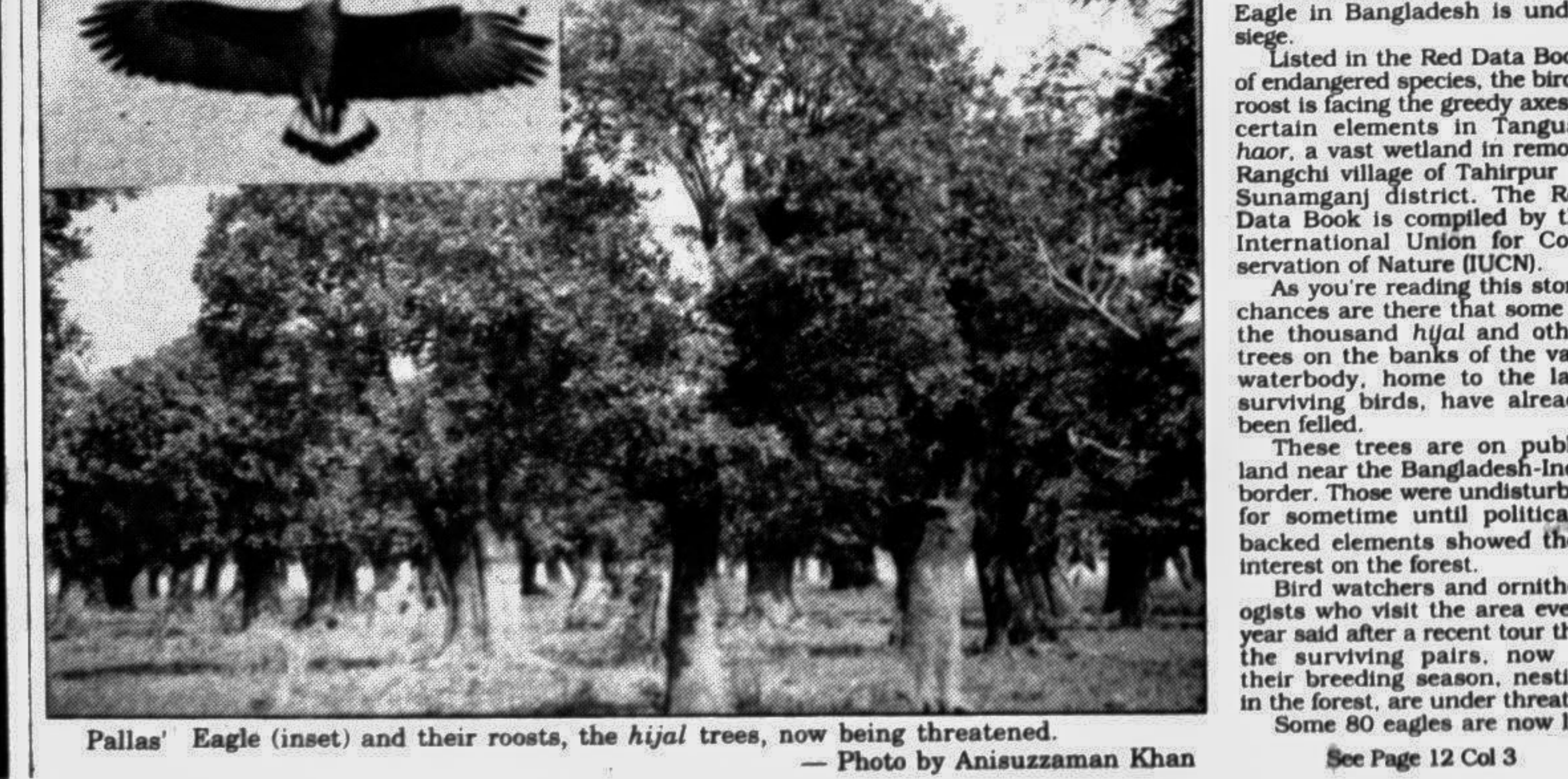
Pallas' Eagle (inset) and their roosts, the hijal trees, now being threatened.

The last retreat of the Pallas' Eagle in Bangladesh is under siege. Listed in the Red Data Book of endangered species, the bird's roost is facing the greedy axes of certain elements in Tangaur haor, a vast wetland in remote Rangchi village of Tahirpur in Sunamganj district. The Red Data Book is compiled by the International Union for Conservation of Nature (IUCN). As you're reading this story, chances are there that some of the thousand hijal and other trees on the banks of the vast waterbody, home to the last surviving birds, have already been felled. These trees are on public land near the Bangladesh-India border. Those were undisturbed for sometime until politically backed elements showed their interest on the forest. Bird watchers and ornithologists who visit the area every year said after a recent tour that the surviving pairs, now in their breeding season, nesting in the forest, are under threat. Some 80 eagles are now liv-