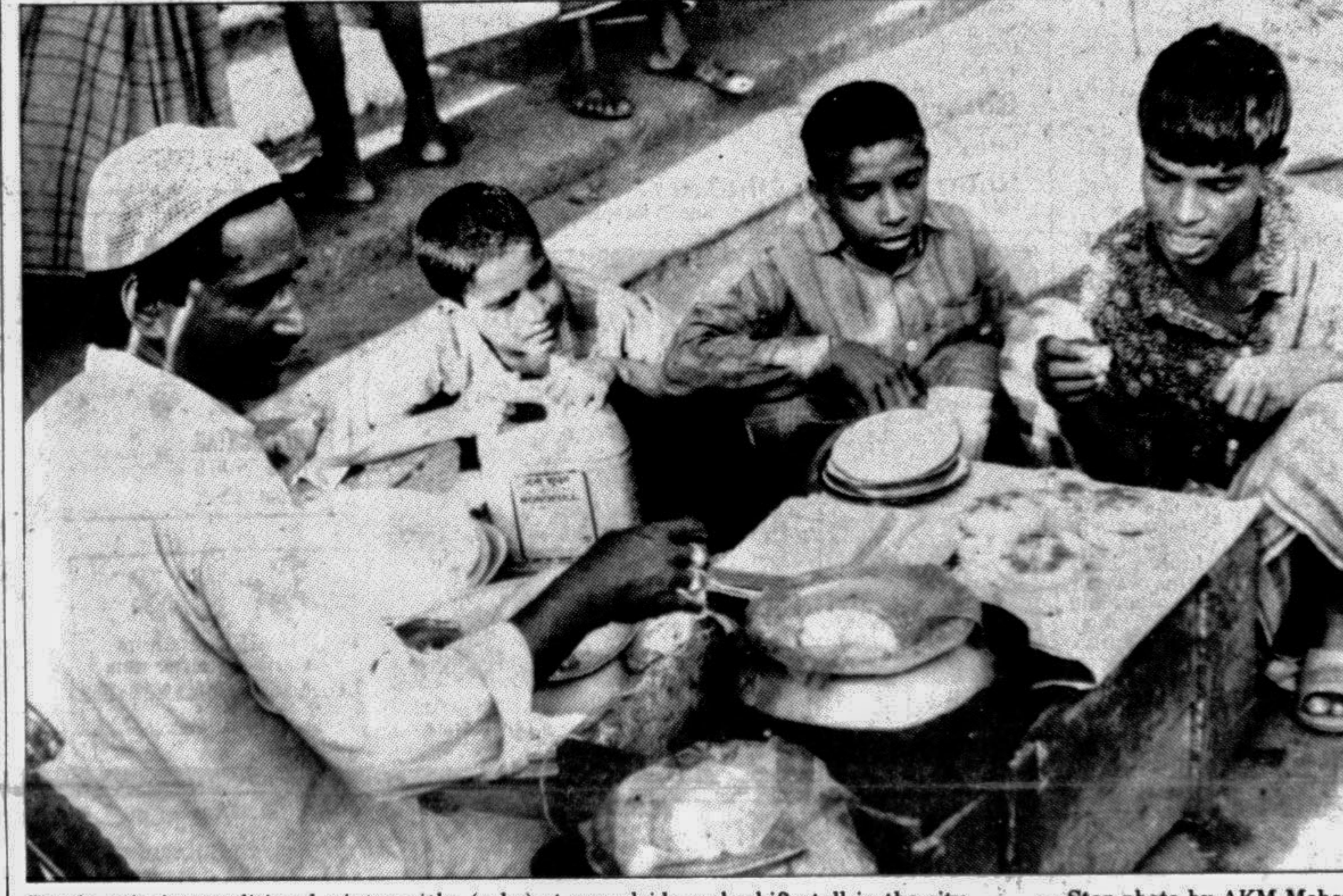
People enjoying traditional winter pitha (cake) at a roadside makeshift stall in the city.