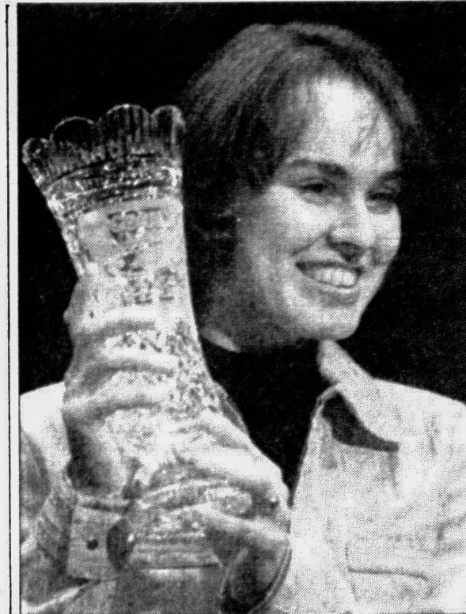
World No 1 Martina Hingis shows off her trophy after being named the WTA's player-of-the-year in New York on Saturday.

"The only time I ever bowled to him was in Durban when we had a game of backyard cricket, but I think I was only about 10 at the time so it will be good to eventually play against him," Pollock said.