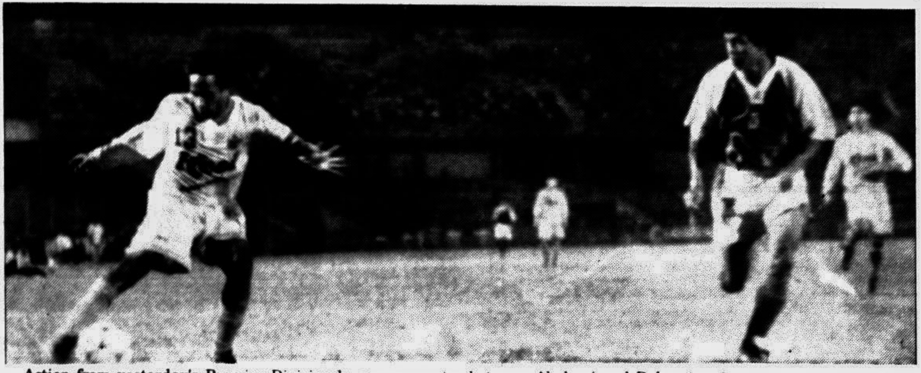
Action from yesterday's Premier Division league encounter between Abahani and Rahmatganj.

S GANGULY... 109 Kuruvilla hit three towering sixes in a career-best unbeaten 35 off 39 balls that finally lived up to proceedings for some 5,000 home fans after three dull days. The late burst rattled the Sri