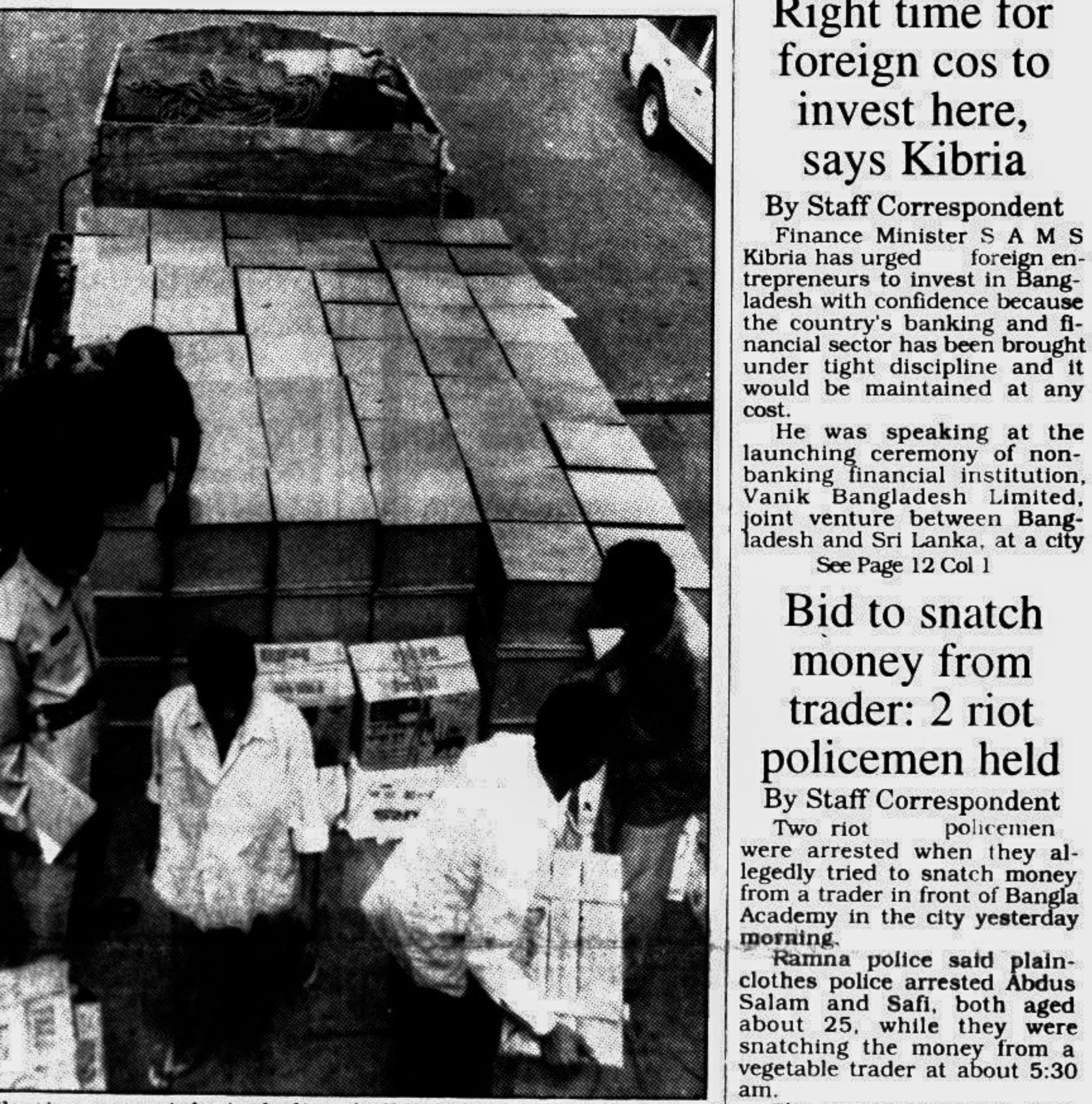
Election materials including ballot boxes, indelible ink, rubber seals and stamp pads are being sent to different areas of the country for the Union Parishad elections beginning on December 1.

By Nurul Kabir The dialogue between the ruling Awami League and the Opposition Bangladesh Nationalist Party has stopped, leaving little hope for a sound working relation between the two feuding political camps in the near future. The dialogue began before the Jatiya Sangsad went into its last session on November 2 and the process ended as the session was prorogued on the 16th. The BNP has been abstaining from attending Sangsad proceedings since August to press a set of demands that include lifting of ban on street rallies in the city, stoppage of alleged repression on political opponents, disclosing contents of the draft accord to be signed with leaders of the tribal people in Chittagong Hill Tracts and so on. BNP refused to return to the House during the last session as the dialogue failed to forge a consensus. "The ruling party has not contacted us for talks after the prorogation of parliament session," said a BNP official.