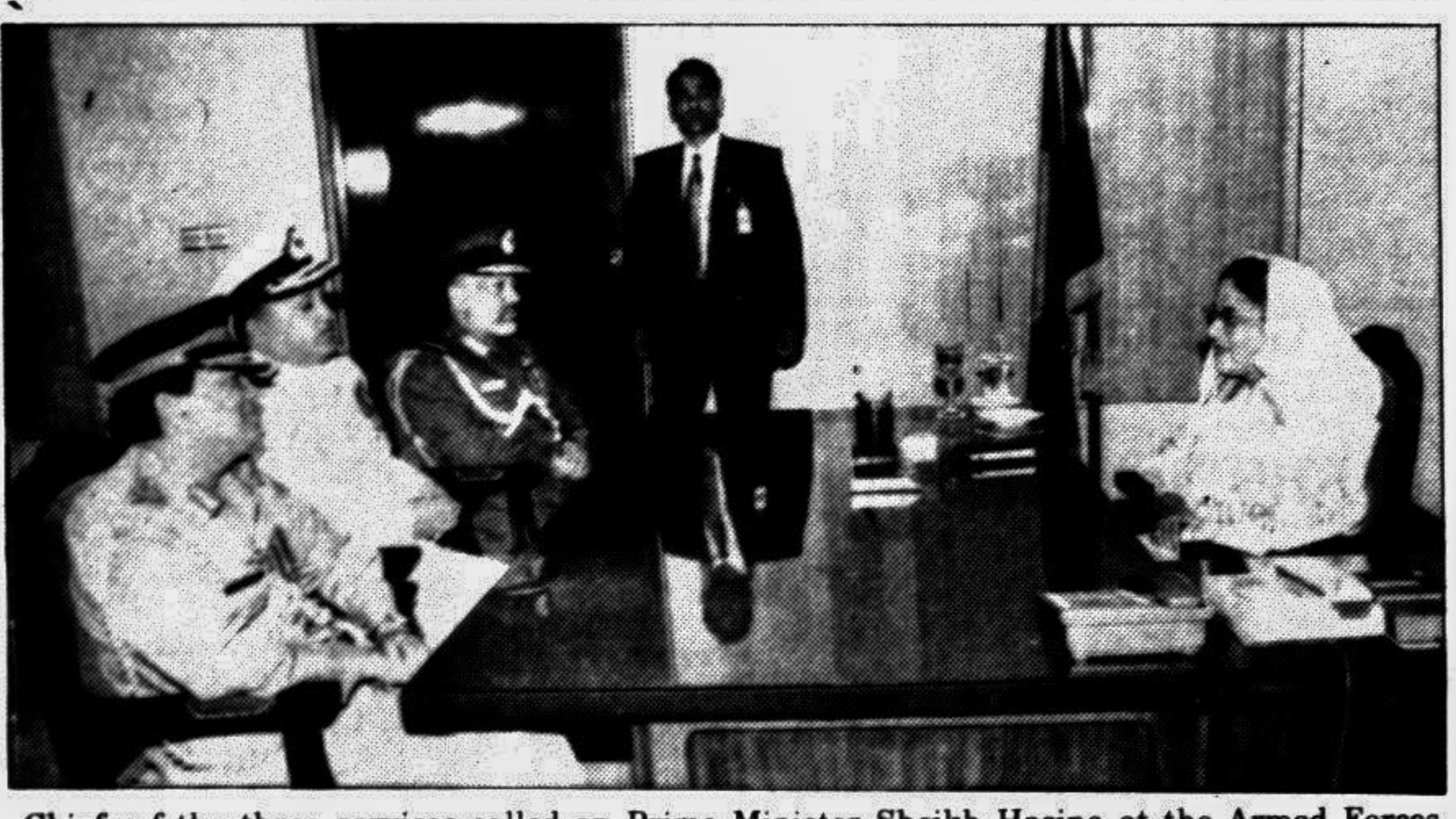
Chiefs of the three services called on Prime Minister Sheikh Hasina at the Armed Forces Division in the city on the Armed Forces Day yesterday.