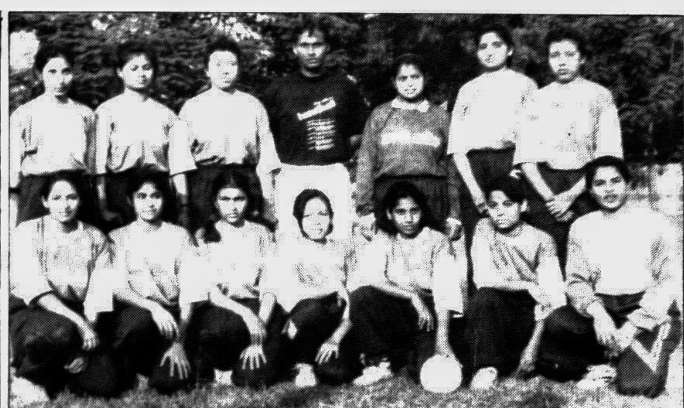
The players of Shamsunnahar Hall who retained the Delta Life Insurance women's inter-college and hall handball trophy after defeating Viquarunnissa School & College in the final yesterday.