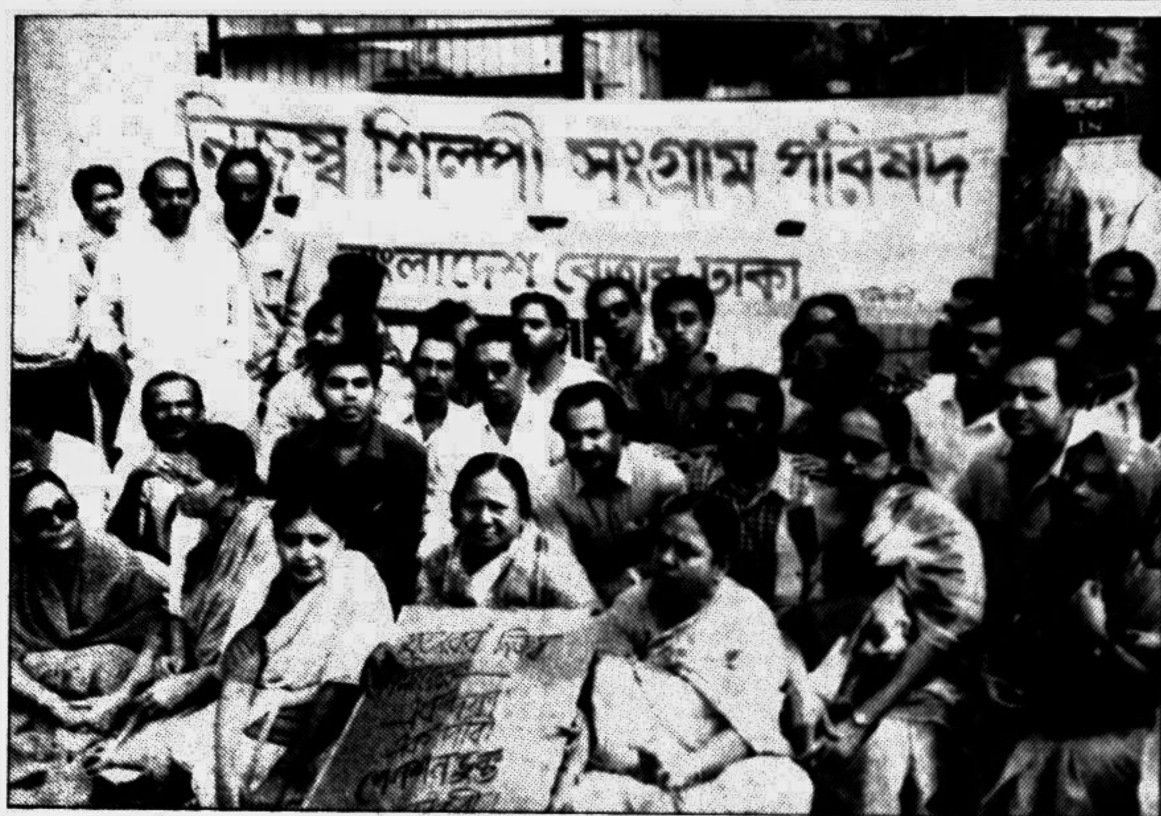
Bangladesh Betar artistes staged a sit-in in front of Betar Bhaban in the city yesterday demanding introduction of pension provision for them.