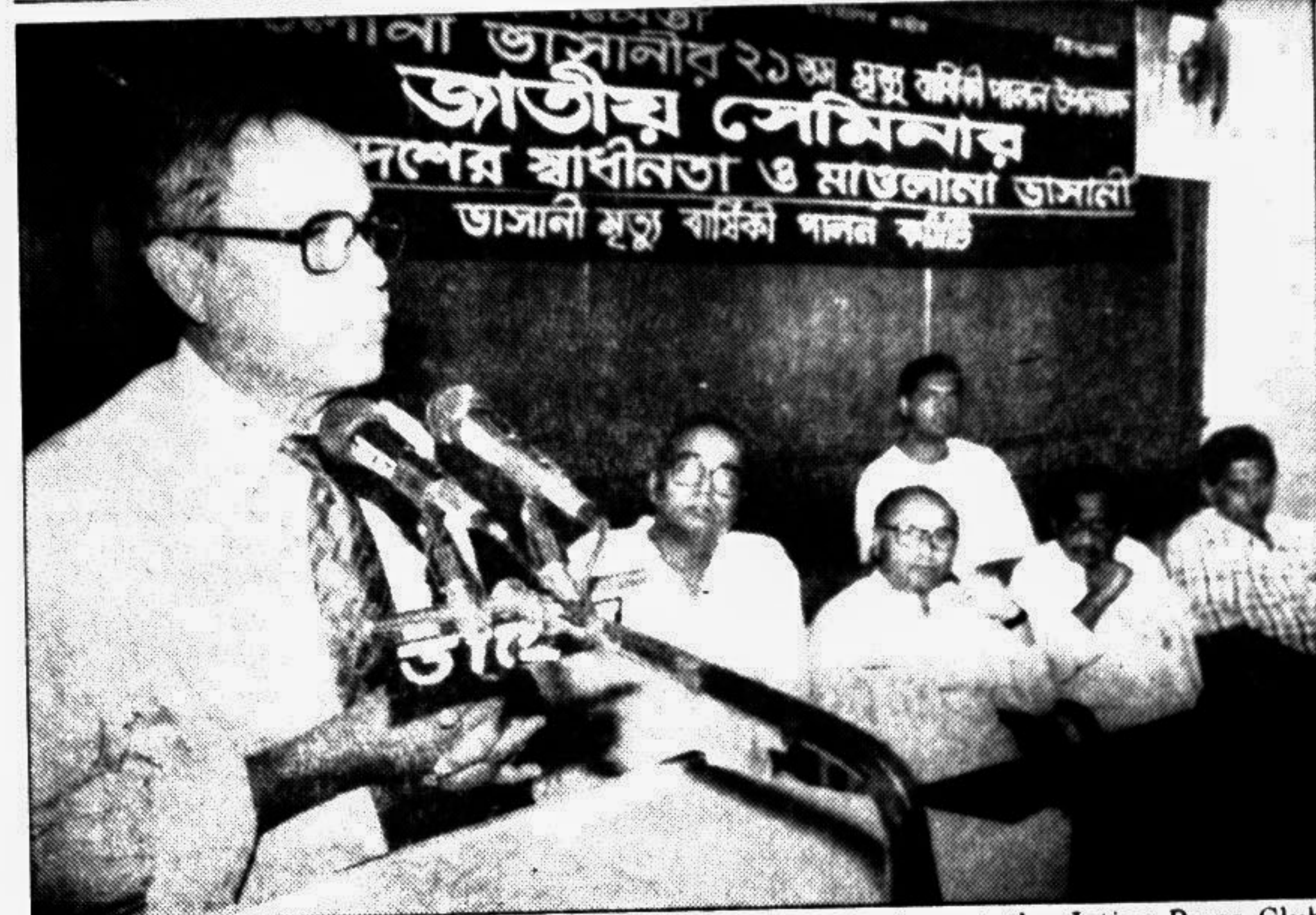
BNP leader Prof. Badruddoza Chowdhury addressing a seminar at the Jatiya Press Club yesterday, organised to mark the 21st death anniversary of Maulana Abdul Hamid Khan Bhasani.