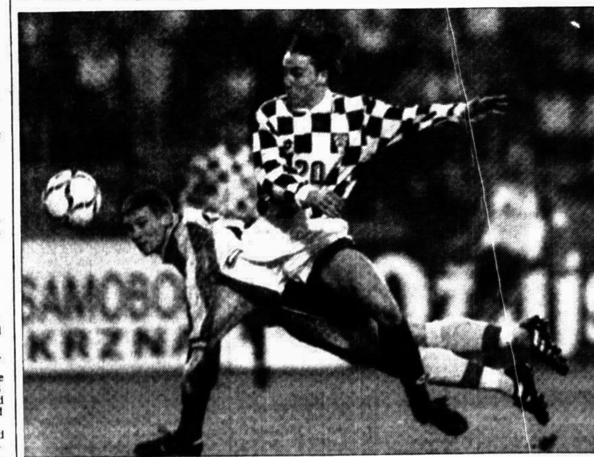
Ukrainian forward Andriy Shevchenko is about to fall after losing the battle for the ball with Croatian Dario Simic during their World Cup second leg play-off in Kiev on Nov 15. The match ended 1-1 with Croatia qualifying for the finals in France.

Saturday's three winners take the total qualified to 27 - with three more to be decided today and the remaining one later in the month in the Oceania-Asia play-off.