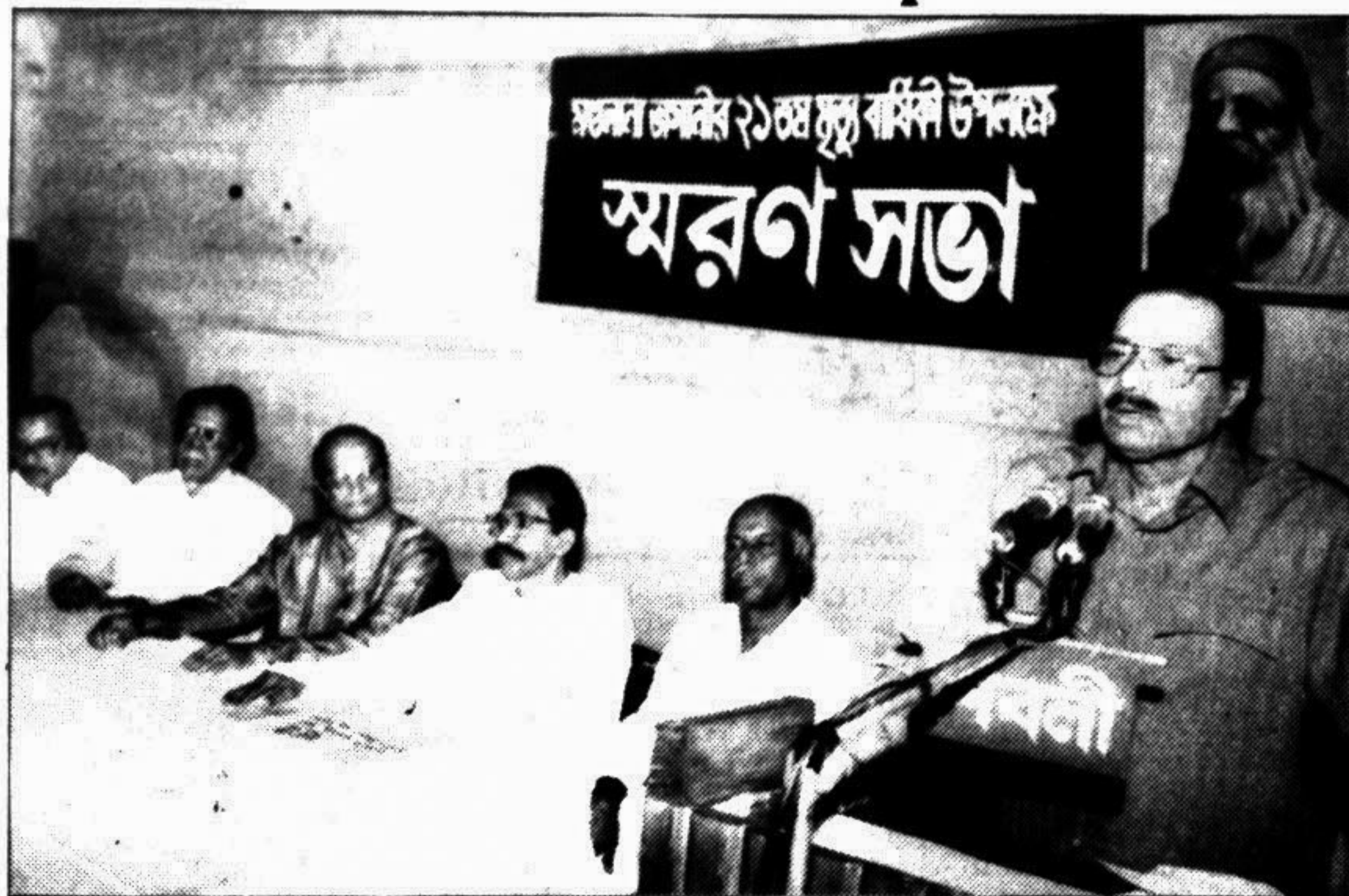
Justice Habibur Rahman addressing as chief guest a discussion meeting yesterday at the Jatiya Press Club auditorium in observance of the 21st death anniversary of Maulana Abdul Hamid Khan Bhashani.

building technology & ideas ltd. TMC BUILDING (1ST FLOOR) 52 NEW ESKATON ROAD DHAKA. TEL 9343950, 9345059 FAX: 880-2-833922 Member of REHAB