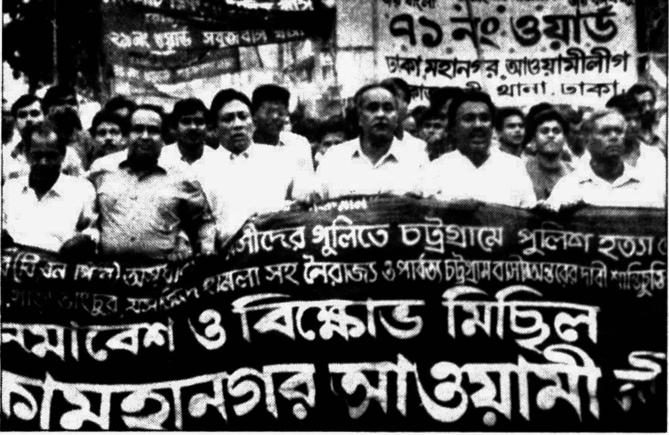
City Awami League brought out a procession yesterday protesting the Tuesday's incident in Chittagong.