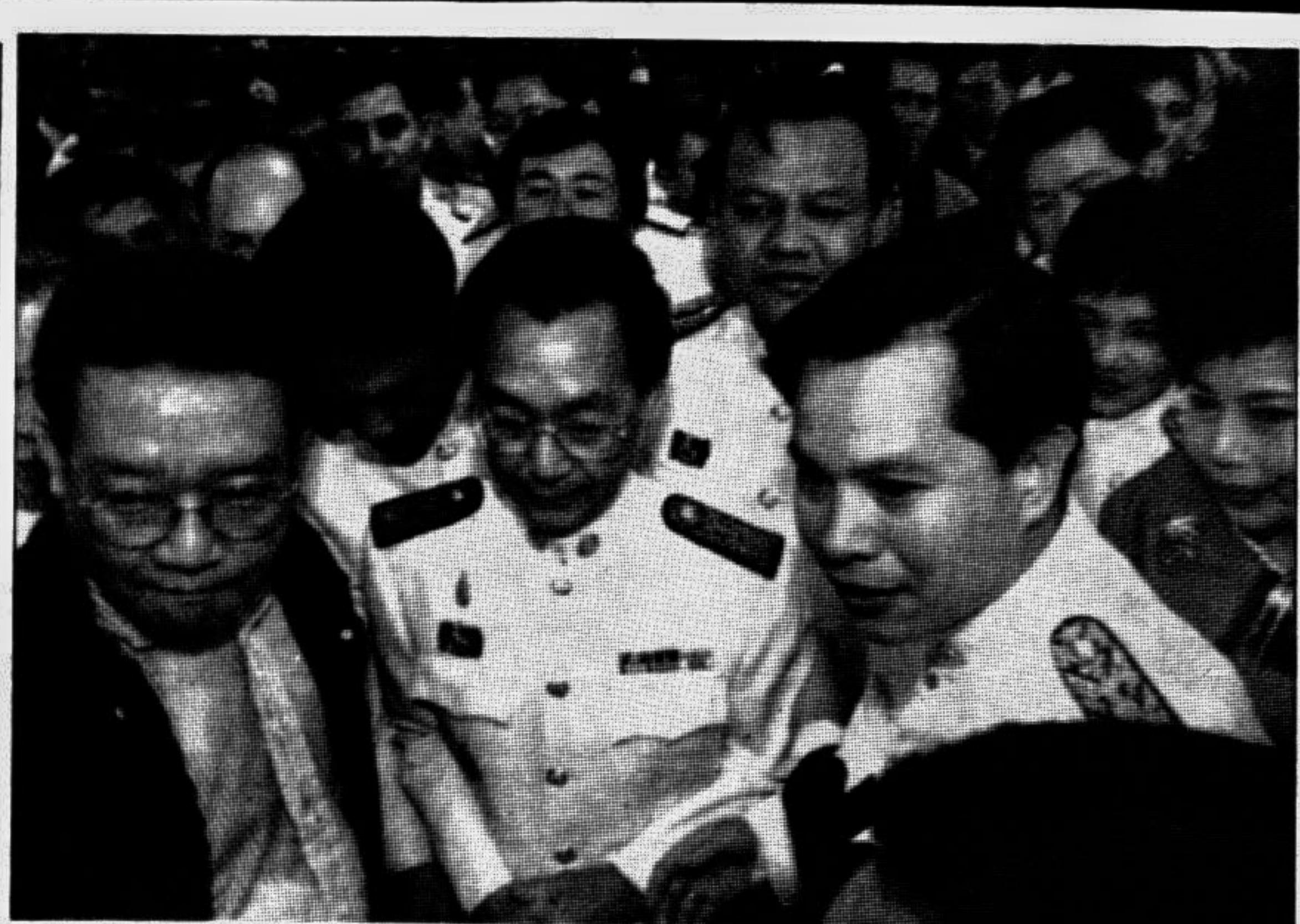
New Thai Prime Minister Chuan Leekpai is led through a crowd of supporters and members of parliament following ceremonies Sunday at Democratic Party headquarters in Bangkok. Chuan takes on the job of leading Thailand back to economic prosperity.

COLOMBO, Nov 10: A Sri Lankan government helicopter gunship crashed off the north-eastern coast Monday and the air force fears it was shot down by ethnic Tamil guerrillas, military officials say, reports AP. The Ukrainian-built MI-24 helicopter, known as the Hind to NATO forces, was searching for rebel boats in the Indian Ocean when it went missing at noon (0600 GMT) after taking off from a nearby air base, said air force officials, who spoke on condition of anonymity.