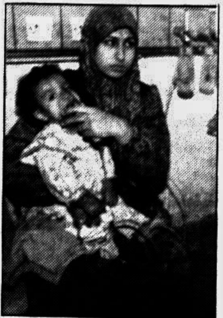
An Iraqi woman holds an oxygen mask over the face of her sick baby daughter in the Saddam Hospital for children in Baghdad Sunday.

Options include banning Iraqi officials who obstruct UN inspections from traveling abroad, restricting imports of equipment that can be used for both civilian and military purposes and canceling periodic reviews of the sanctions programme. "The Iraqis have to come to the one conclusion to rescind their decision and comply by Security Council resolutions," said one of the envoys, Swedish diplomat Jan Eliasson. "It would be in their enlightened self-interest to do so." Annan will circulate the envoys' report to the United States and other council members Monday. US and British diplomats will also spend the morning conferring with council colleagues to see how far they are willing to go in punishing Iraq. Options include banning Iraqi officials who obstruct UN inspections from traveling abroad, restricting imports of equipment that can be used for both civilian and military purposes and canceling periodic reviews of the sanctions programme.