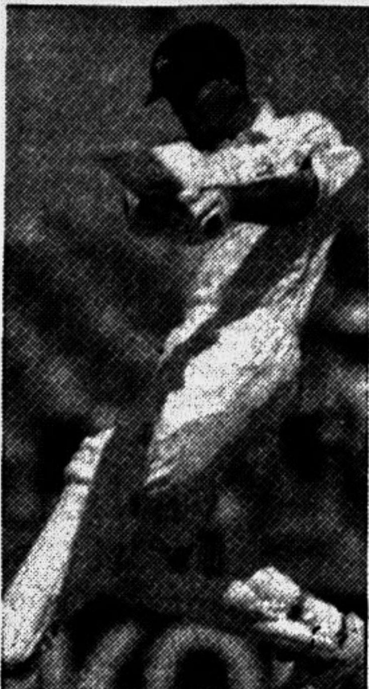
PONTING ... 71 n.o.

fourth day of the first cricket Test between Australia and New Zealand at the Gabba Ground in Brisbane. AUSTRALIA: First innings 373 (M Taylor 112, P Reiffel 77; S Doull 4-70, C Cairns 4-90) NEW ZEALAND: First innings 349 (S Fleming 91; C Cairns 64; S Warne 4-106) AUSTRALIA: Second in-