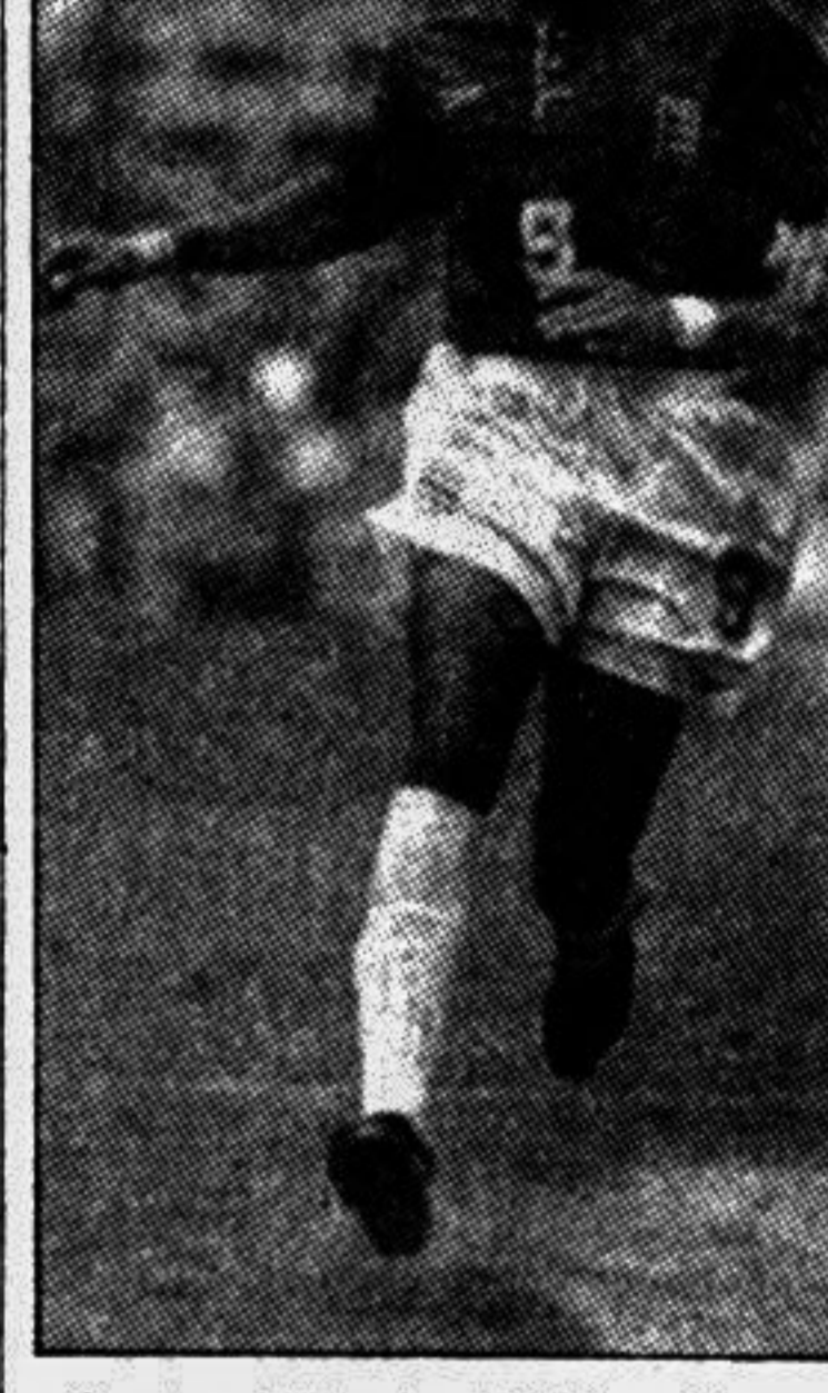
Costa Rica's Pablo Cesar Wanchope (L) and Camilo Romero of Mexico fight for the ball during their World Cup qualifier on Nov 9. The match ended in a 3-3 draw.

The Americans beat Canada 3-0 away, a result which, combined with El Salvador's failure to beat Jamaica in San Salvador, was enough to earn them a place at their third successive World Cup finals.