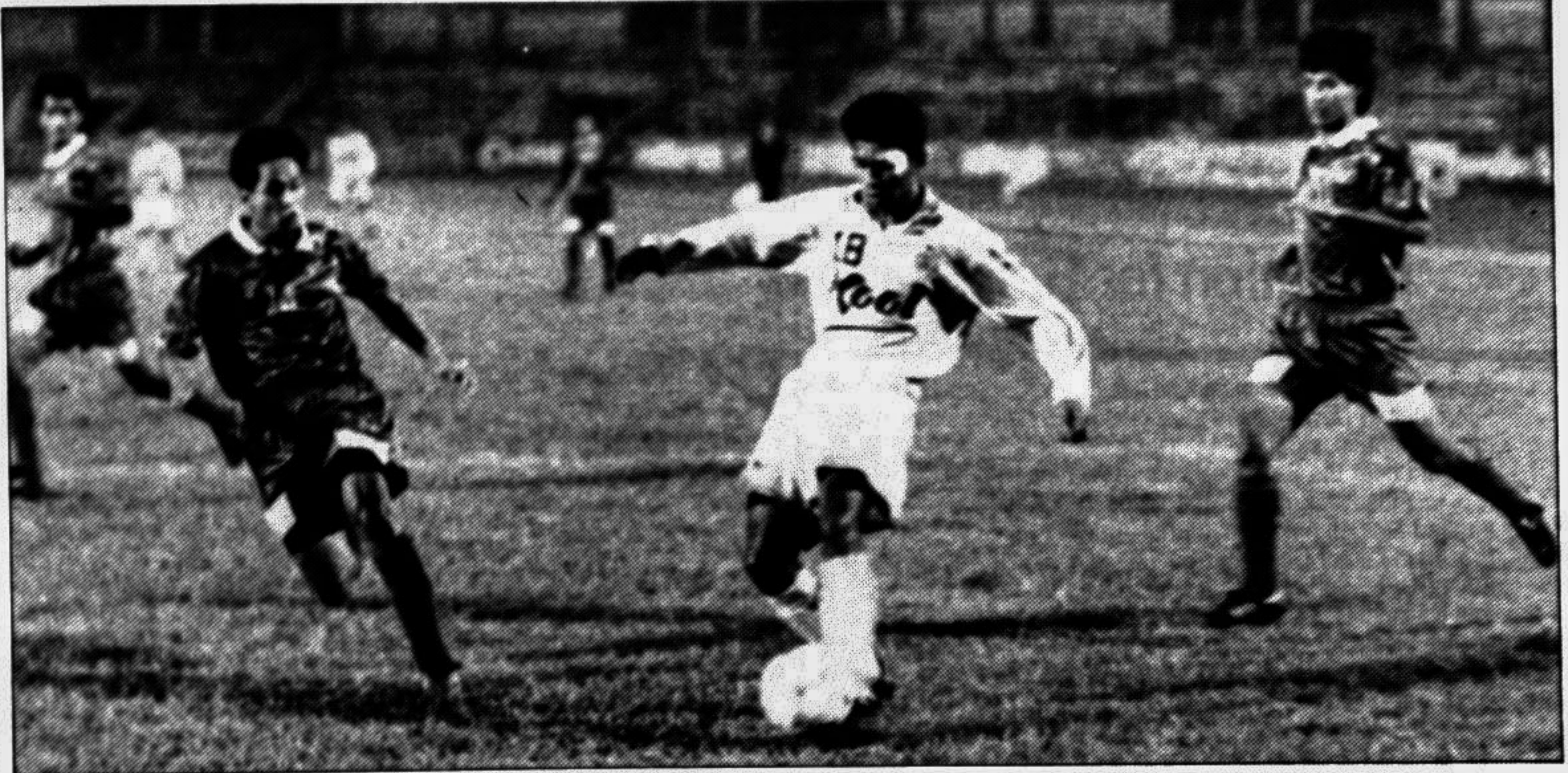
Action from yesterday's Premier Division football league encounter between Abahani Krira Chakra and Fakirerpool at the Mirpur Stadium. Abahani won 2-1.