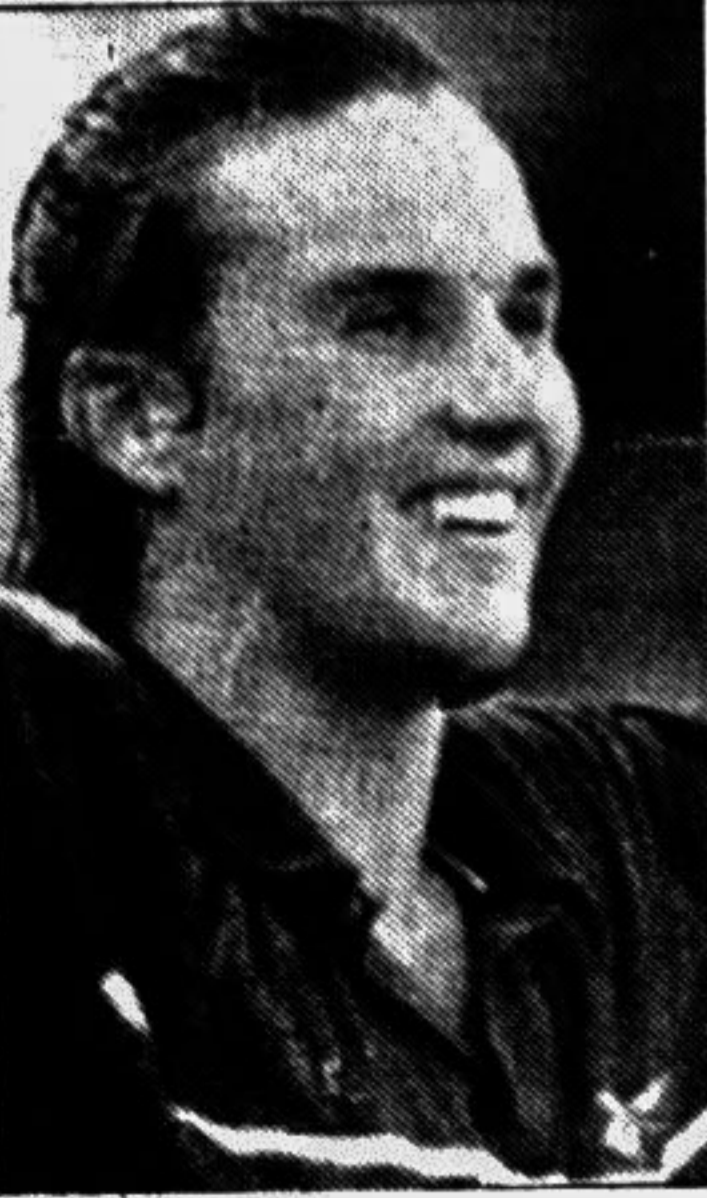
Patrick Rafter (Australian tennis player) "I'll still be the same sack of crap I am." After his success at the US Open.