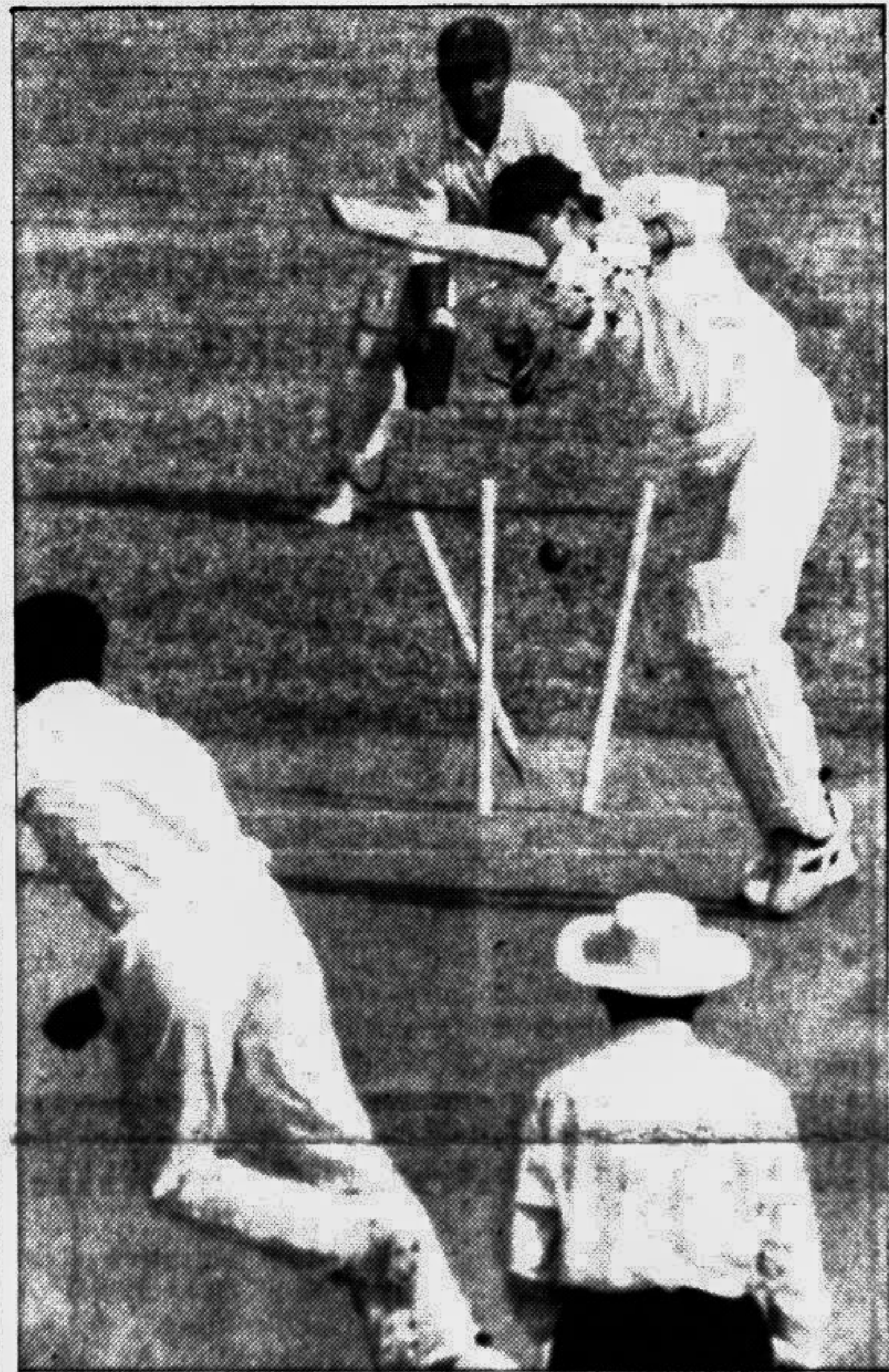
Abahani's Pakistani recruit Shahid Afridi gets his stumps disorganised by Shanto Mohammedan Sporting Club during the Damal Smriti cricket final at the Dhaka Stadium yesterday. Abahani won the title beating their arch-rivals by 73 runs. (Story on Page 11)