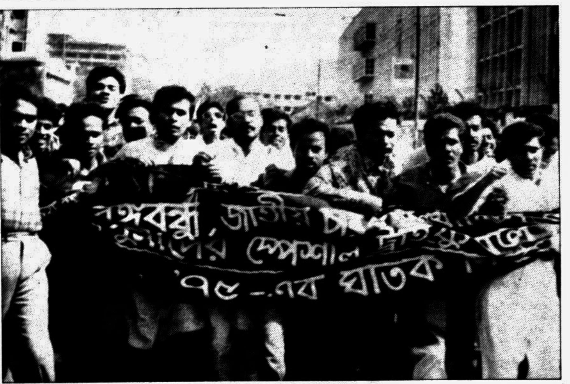
Ghatak Nirmul Committee brought out a procession in the city yesterday demanding trial of the killers of four national leaders.