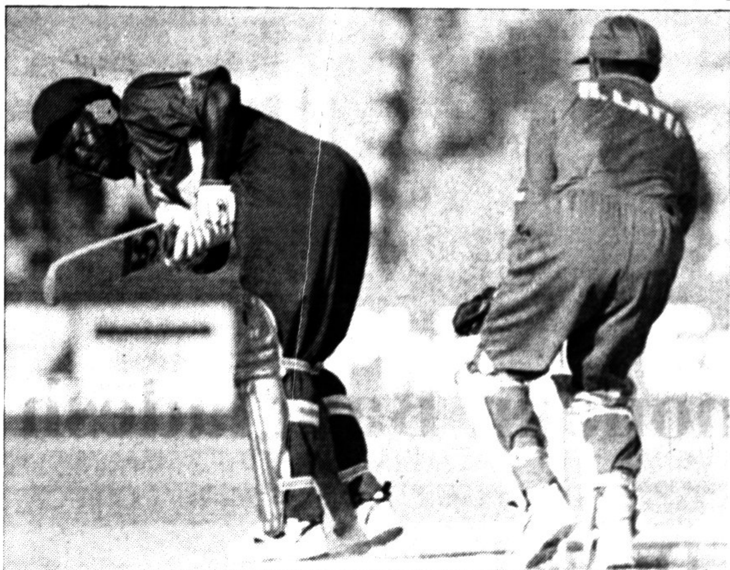
West Indies opener Stuart Williams sweeps Pakistan left-arm spinner Aamir Sohail (not in picture) for a boundary during their yesterday's quadrangular cricket tournament clash at the Gaddafi Stadium in Lahore. The West Indian scored his side's highest 75.