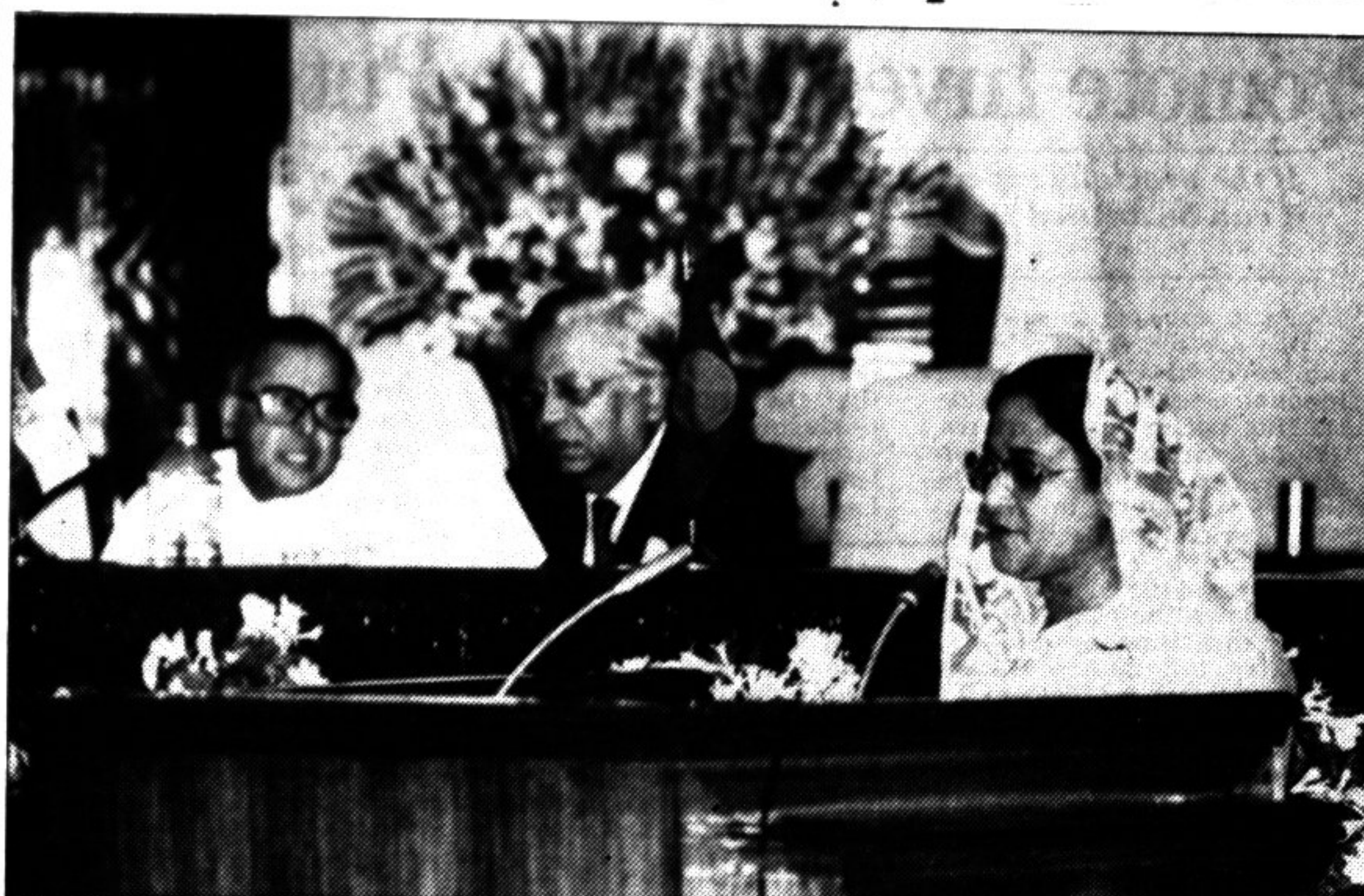
Prime Minister Sheikh Hasina delivering her inaugural speech at a three-day post-election seminar for members of Bangladesh Jatiya Sangsad at the International Conference Centre in the city yesterday. The seminar has been organised by the Commonwealth Parliamentary Association and the Bangladesh Parliament Secretariat.

Rotary Club of Dhaka South: The regular weekly meeting, followed by a meeting of the board of directors, will be held. Venue: Hotel Purbani. Time 5:30 pm.