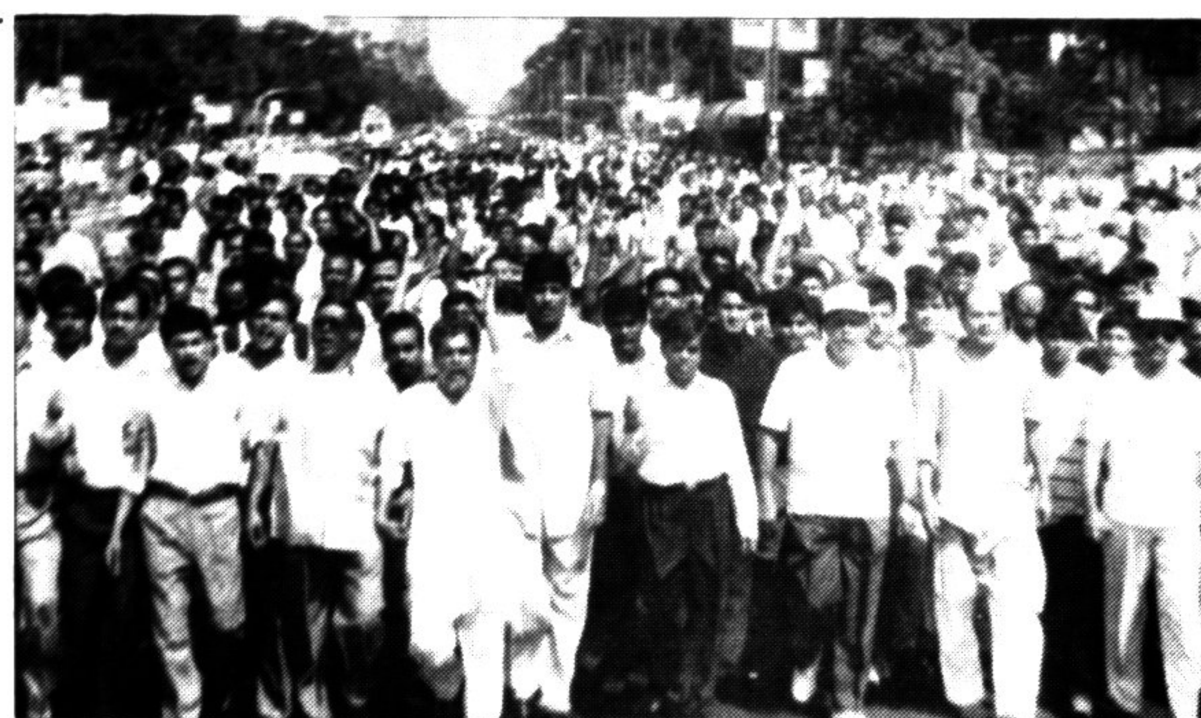
An anti-hartal procession was brought out by ruling Awami League at Mohakhali in the city yesterday.

"Otherwise," Rehman warned, "We face the risk of being marginalised by the global competition."