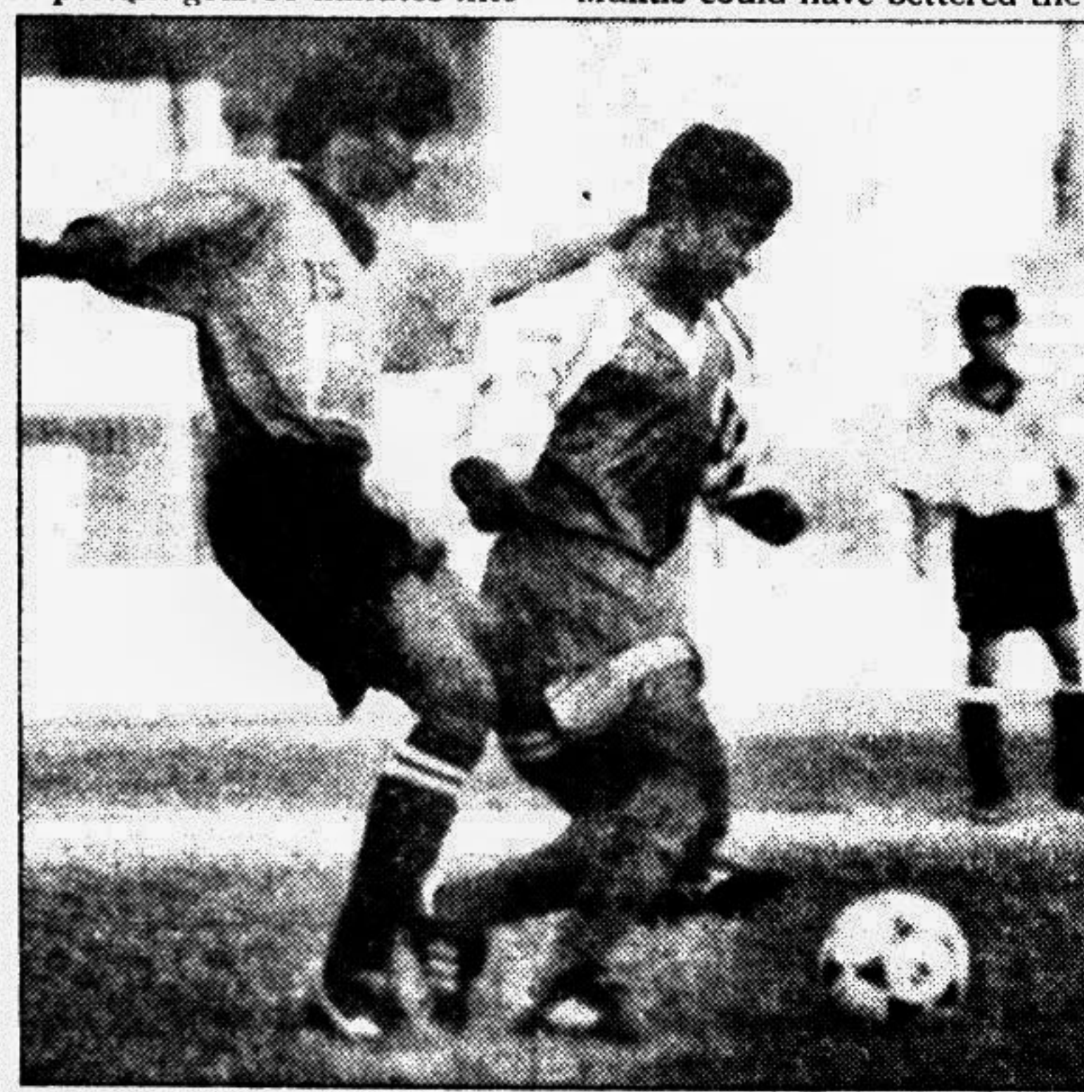
Action from yesterday's Premier Division football league encounter between Muktijoddha Sangsad KC and Brothers Union at the Mirpur Stadium. Muktis won the match 1-0.

Brothers however remained glued to their collection of seven points from five outings.