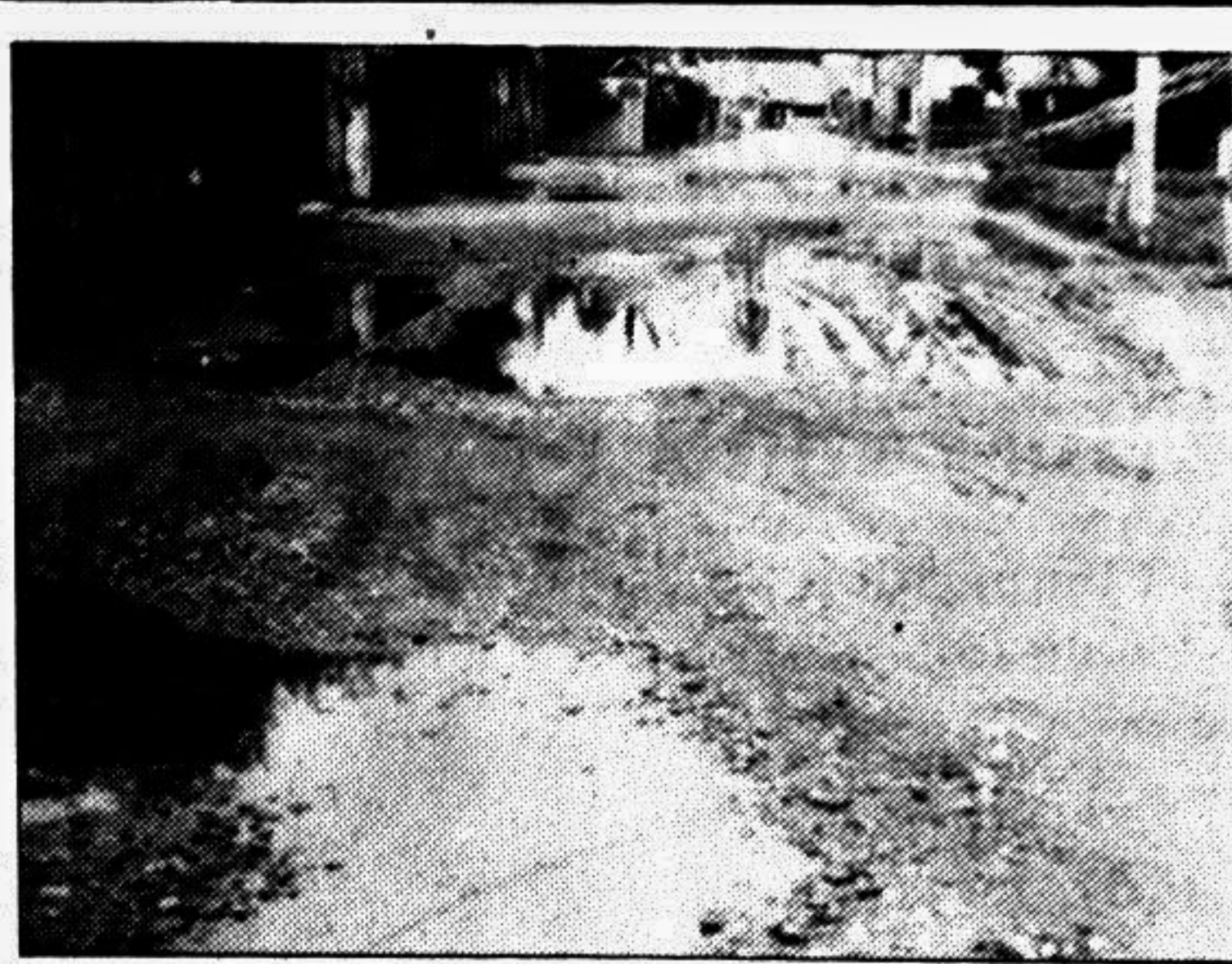
RANGPUR: Cracks and potholes have been developed on an important road at Babupara near Alamnagar rail gate in the town.

The processionists carried banners, placards and festoons to motivate the people towards building the youths as worthy citizens and main working force of the country.