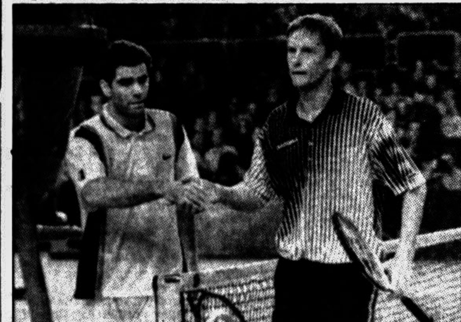
World No 1 Pete Sampras (L) of the United States and Yevgeny Kafelnikov of Russia shake hands after their Paris Open semi-final match on Saturday. Sampras won 7-6, 6-3.

He needed two before wrapping up victory in one hour 44 minutes.