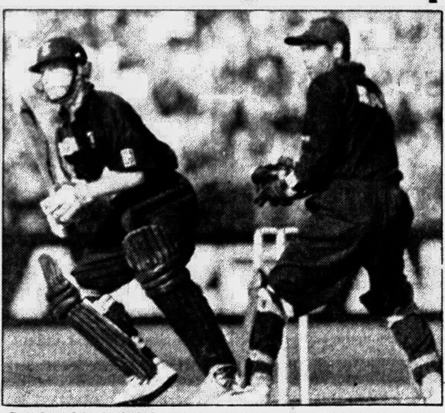
South Africa's left-handed opener Gary Kirsten cuts the ball on his way to a dazzling 89 during the quadrangular limited-overs match against Pakistan at the Gaddafi Stadium in Lahore yesterday. South Africa won by nine runs.

Meanwhile, in the weather-ragged match in Hobart where the first two days were abandoned for rain, Western Australia were 21 for one in reply to Tasmania's 366 for five declared.