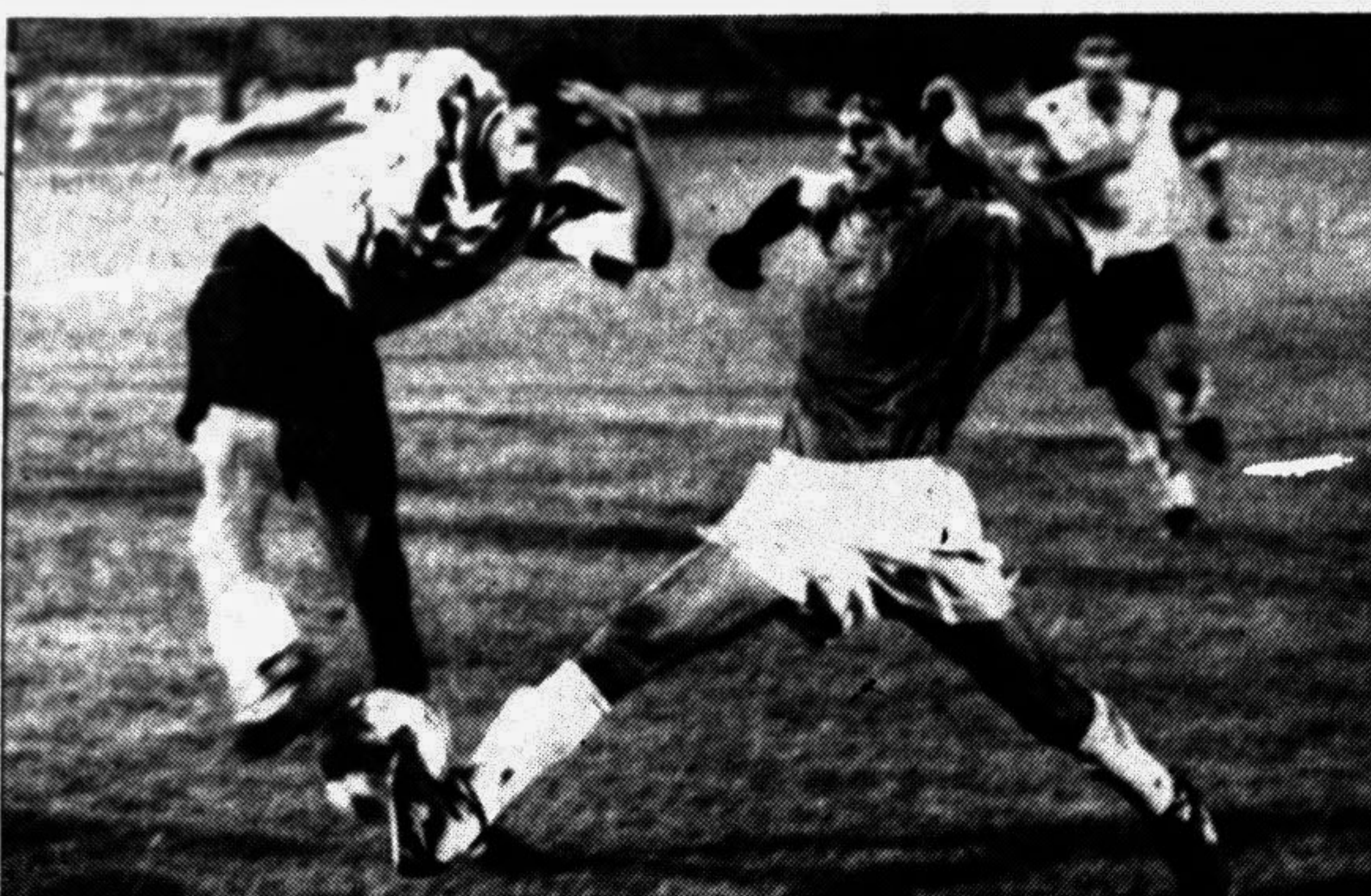
Action from yesterday's Premier Division football league encounter between Mohammedan Sporting Club and Farashganj Sporting Club at the Mirpur Stadium.