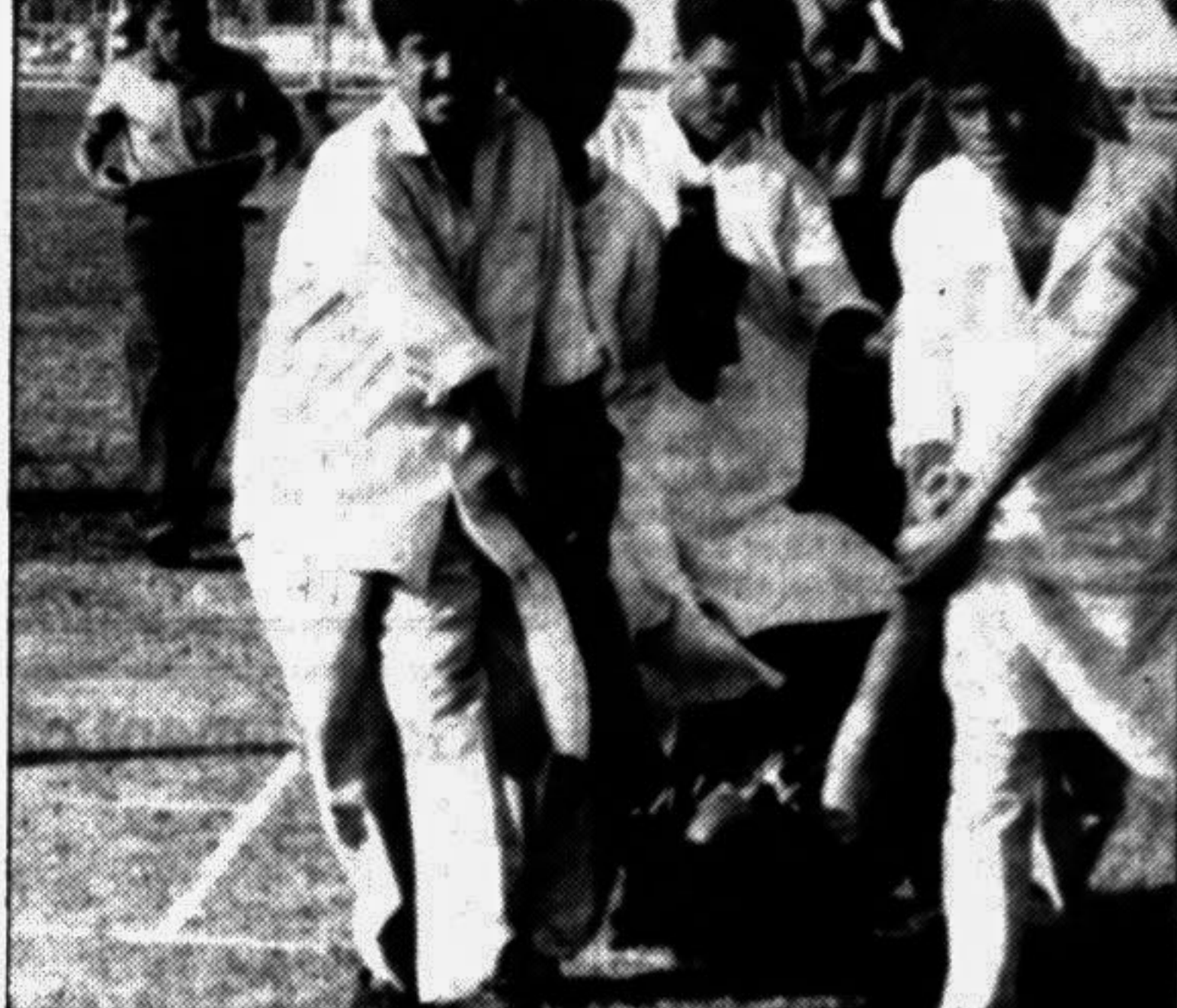
An injured cricket fan, who jumped from the top of the gallery and broke his leg while trying to escape the tear gas hurled by police into the stands, being rescued by some fellow spectators at the Dhaka Stadium.