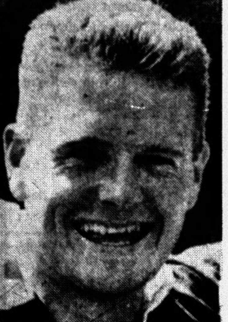
Paul Gascoigne (England footballer) 'I do not have any respect for any journalist, none whatsoever.'