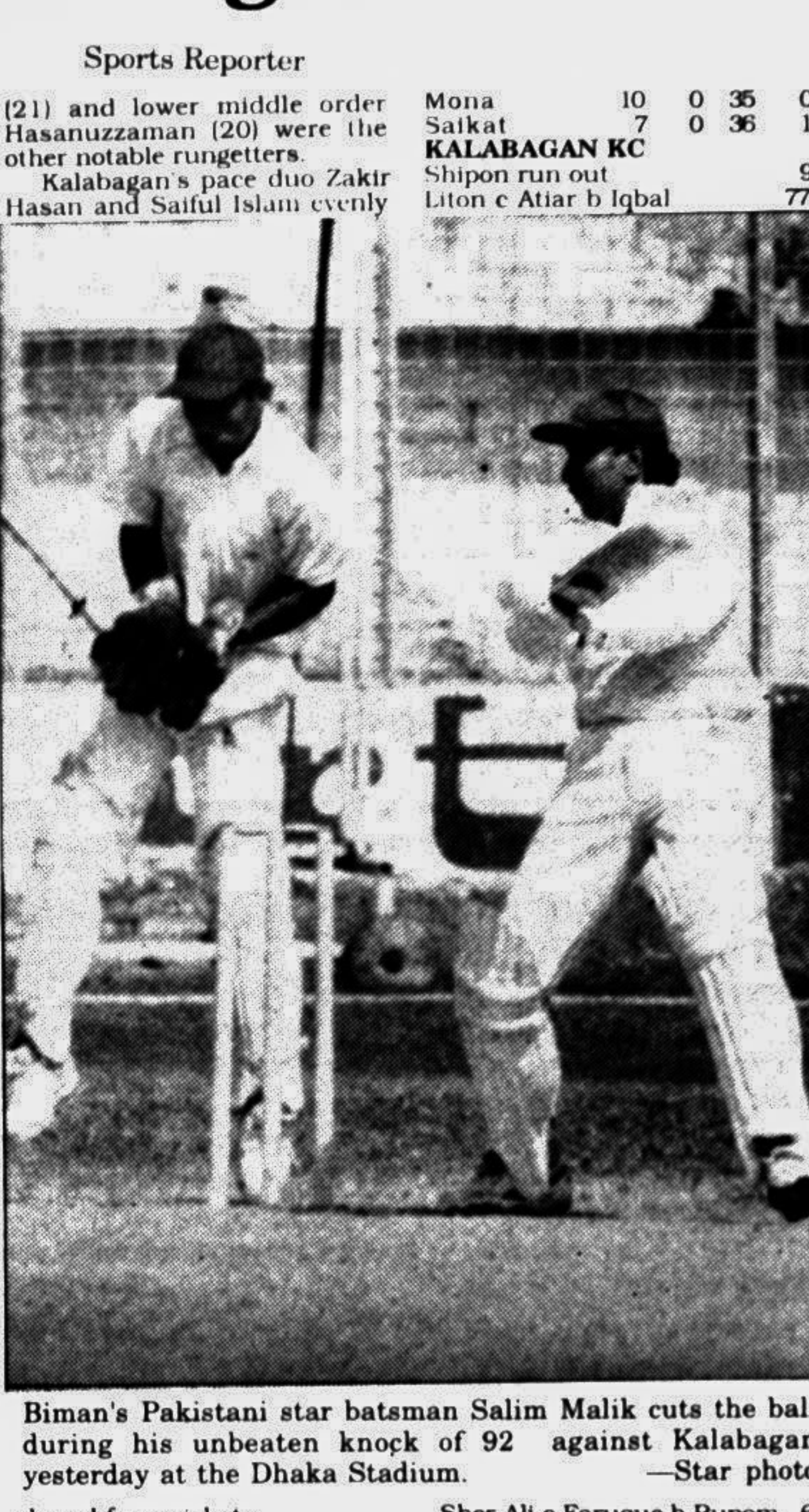
Biman's Pakistani star batsman Salim Malik cuts the ball during his unbeaten knock of 92 against Kalabagan yesterday at the Dhaka Stadium.