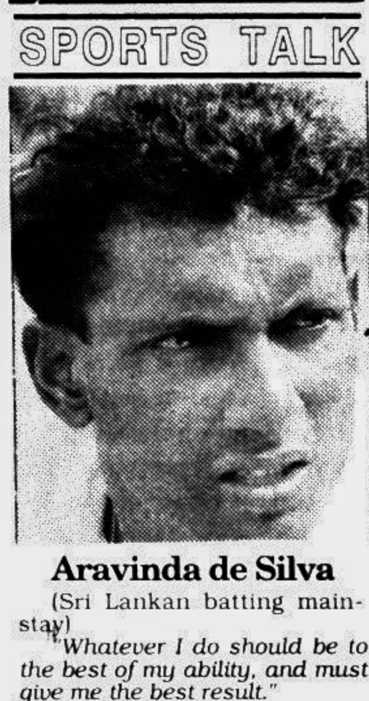
Aravinda de Silva (Sri Lanka batting mainstay)

"Whatever I do should be to the best of my ability, and must give me the best result."