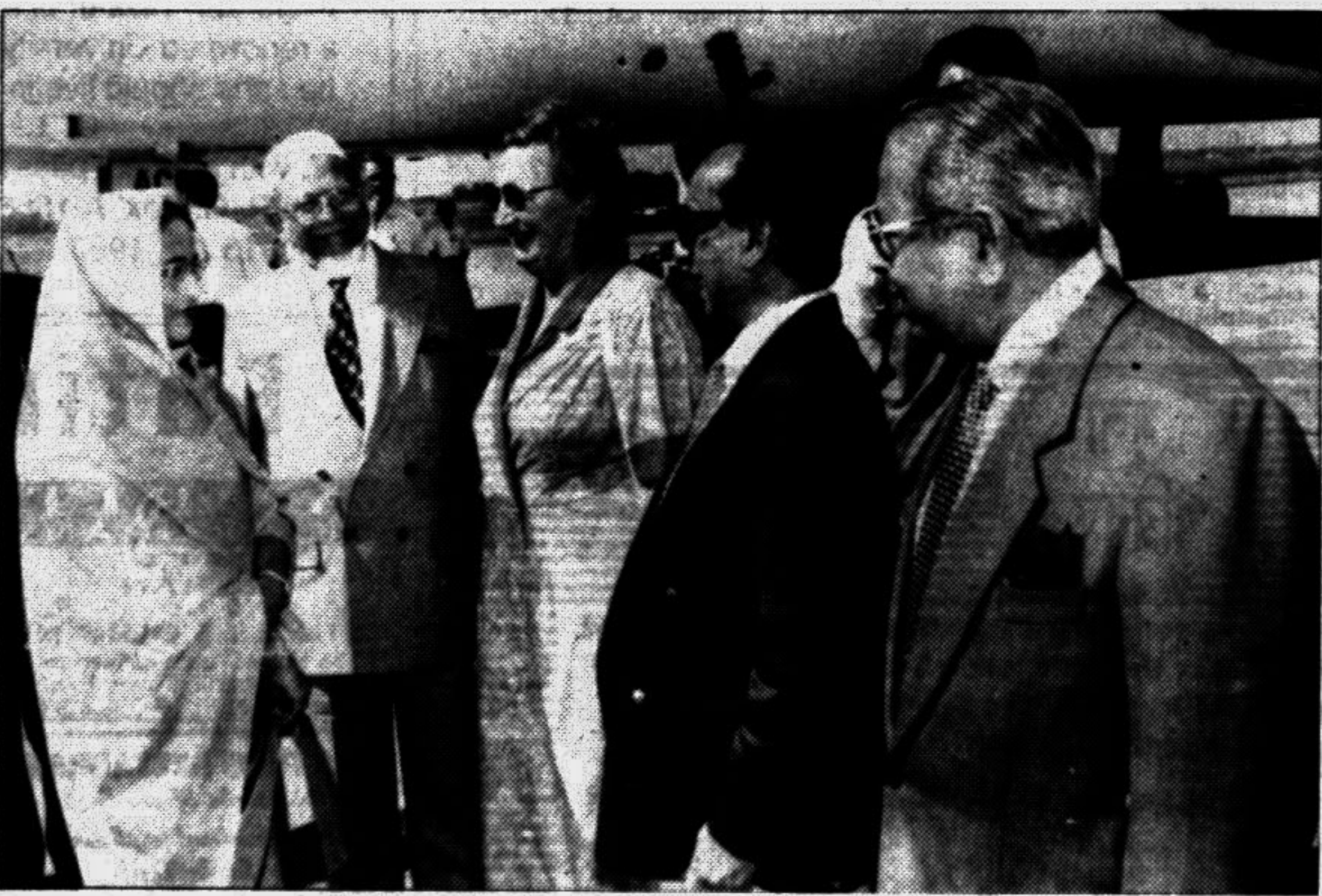
Prime Minister Sheikh Hasina being received by Foreign Minister Abdus Samad Azad at Zia International Airport on her return from the UK yesterday.