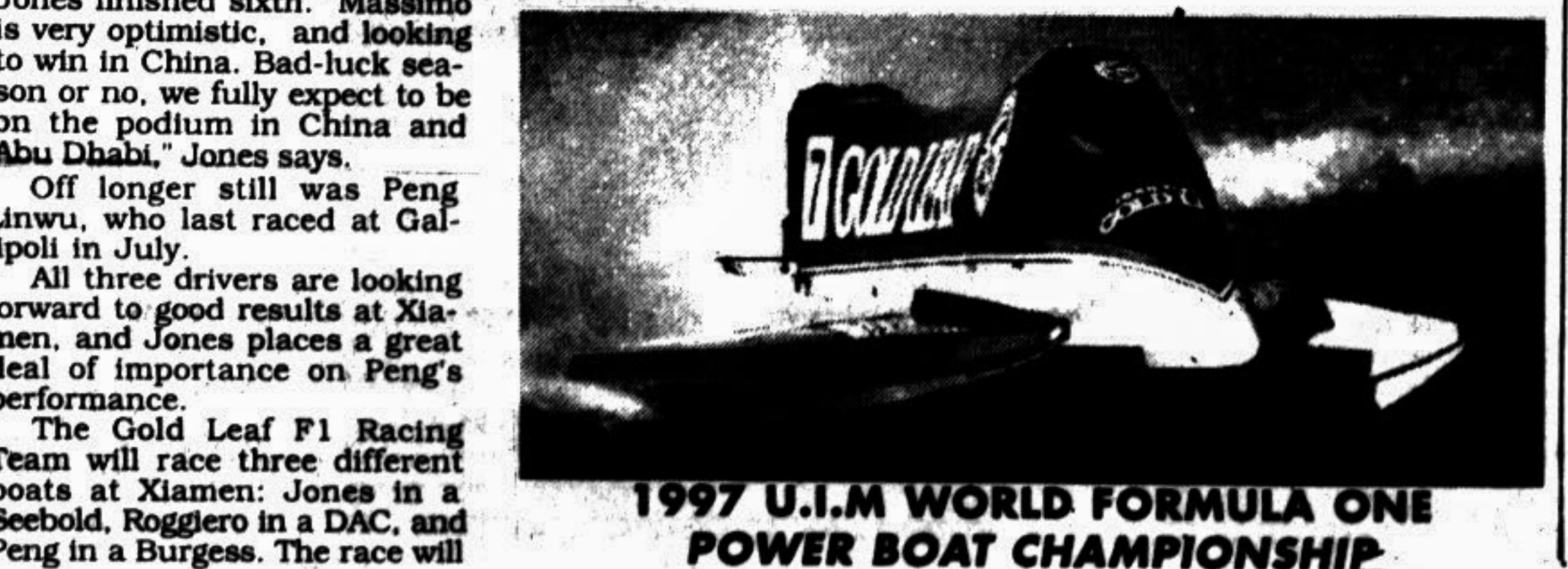
1997 U.I.M World Formula One Power Boat Championship