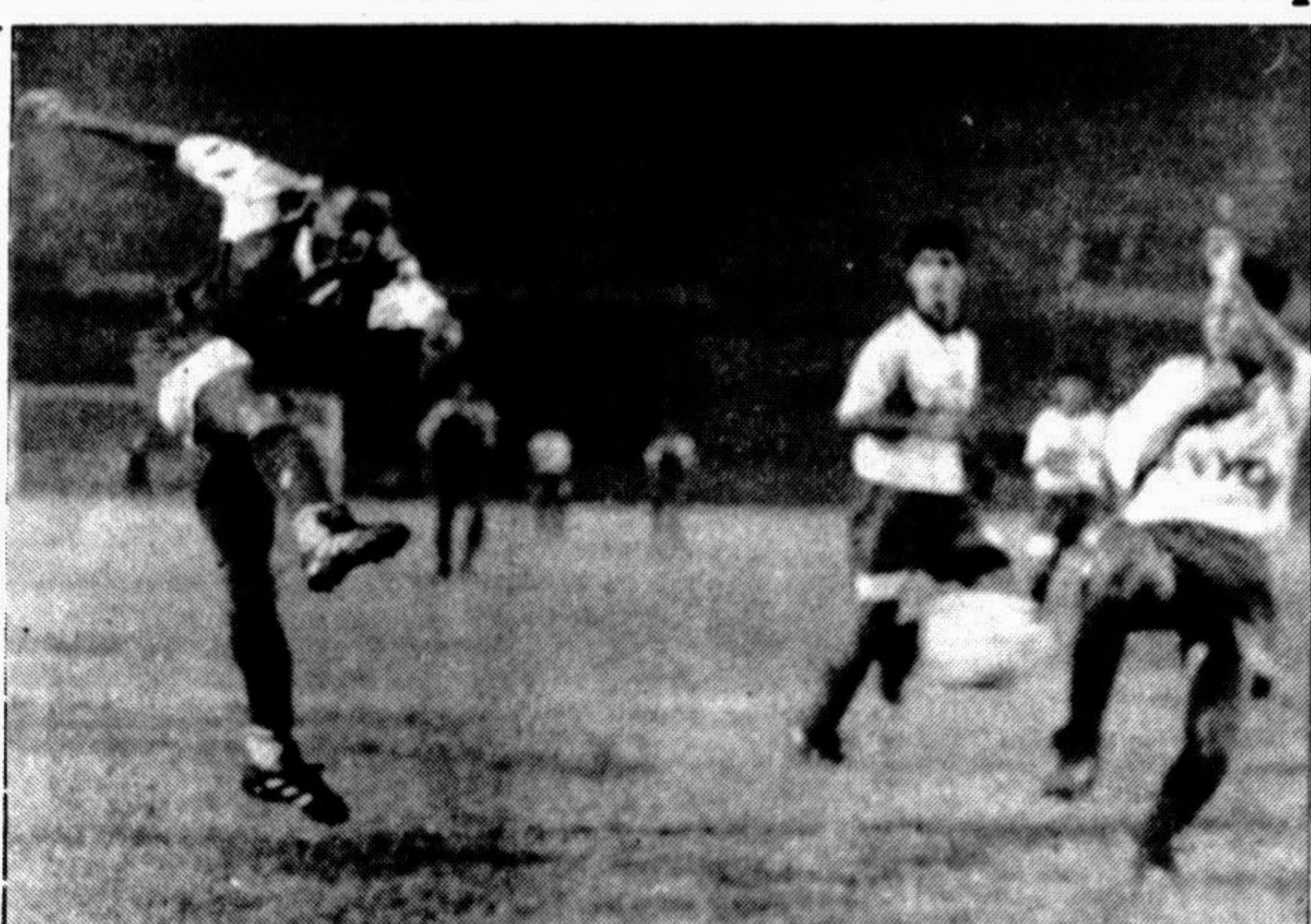
Action from yesterday's Premier Division football league encounter between Muktijoddha Sangsad Krira Chakra and Youngmen's Club Fakirerpool at the Mirpur Stadium. Muktis won the match 2-0.