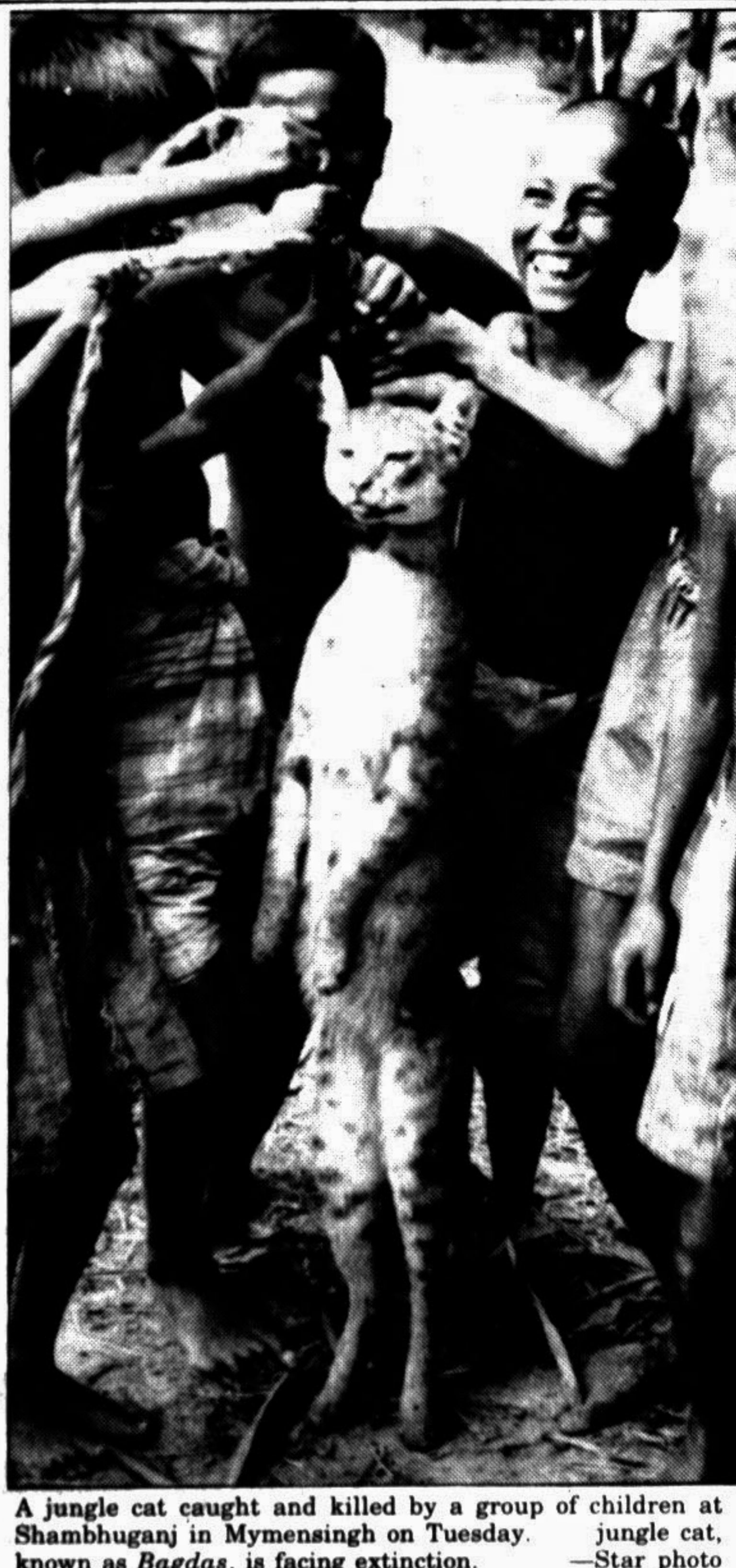
A jungle cat caught and killed by a group of children at Shambhuganj in Mymensingh on Tuesday. The jungle cat, known as Bagdas, is facing extinction.

From Our Correspondent RAJSHAHI, Oct 29: A day-long strike was observed on Rajshahi University campus today. Rajshahi University Teachers' Association and Rajshahi University Officer-Karmachari Oikya Parishad jointly called the strike to protest the 20 per cent cut in pension money of the university teachers, officers and employees. No class was held and all offices remained closed during the strike period. Plying of vehicles was also suspended.