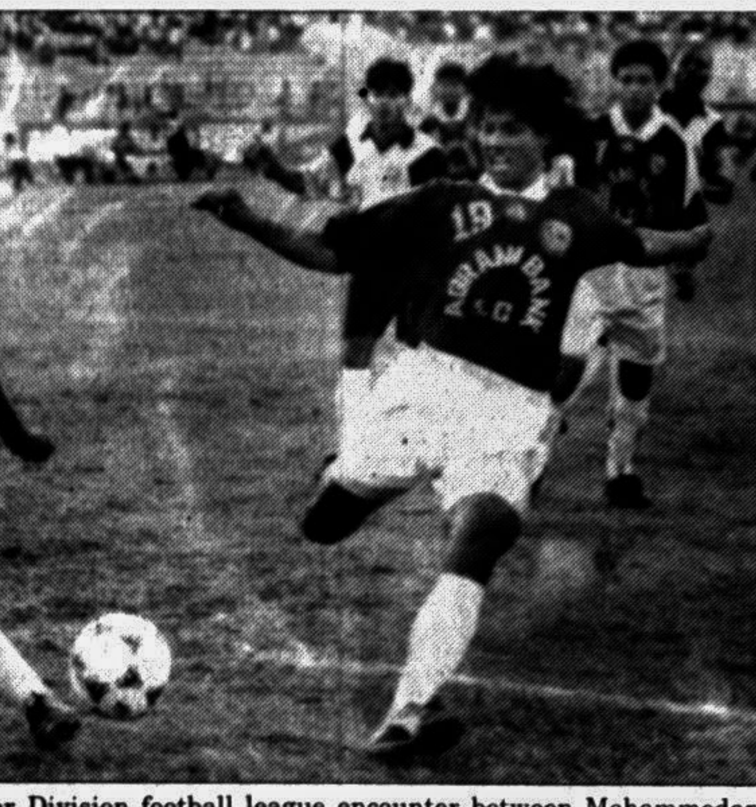
Action from yesterday's Premier Division football league encounter between Mohammedan Sporting Club and Agrani Bank at the Mirpur Stadium.

Sealed Tender Inviting in BD Form No 2911 1. Tender Notice No : 235/RDD of 1997-98.