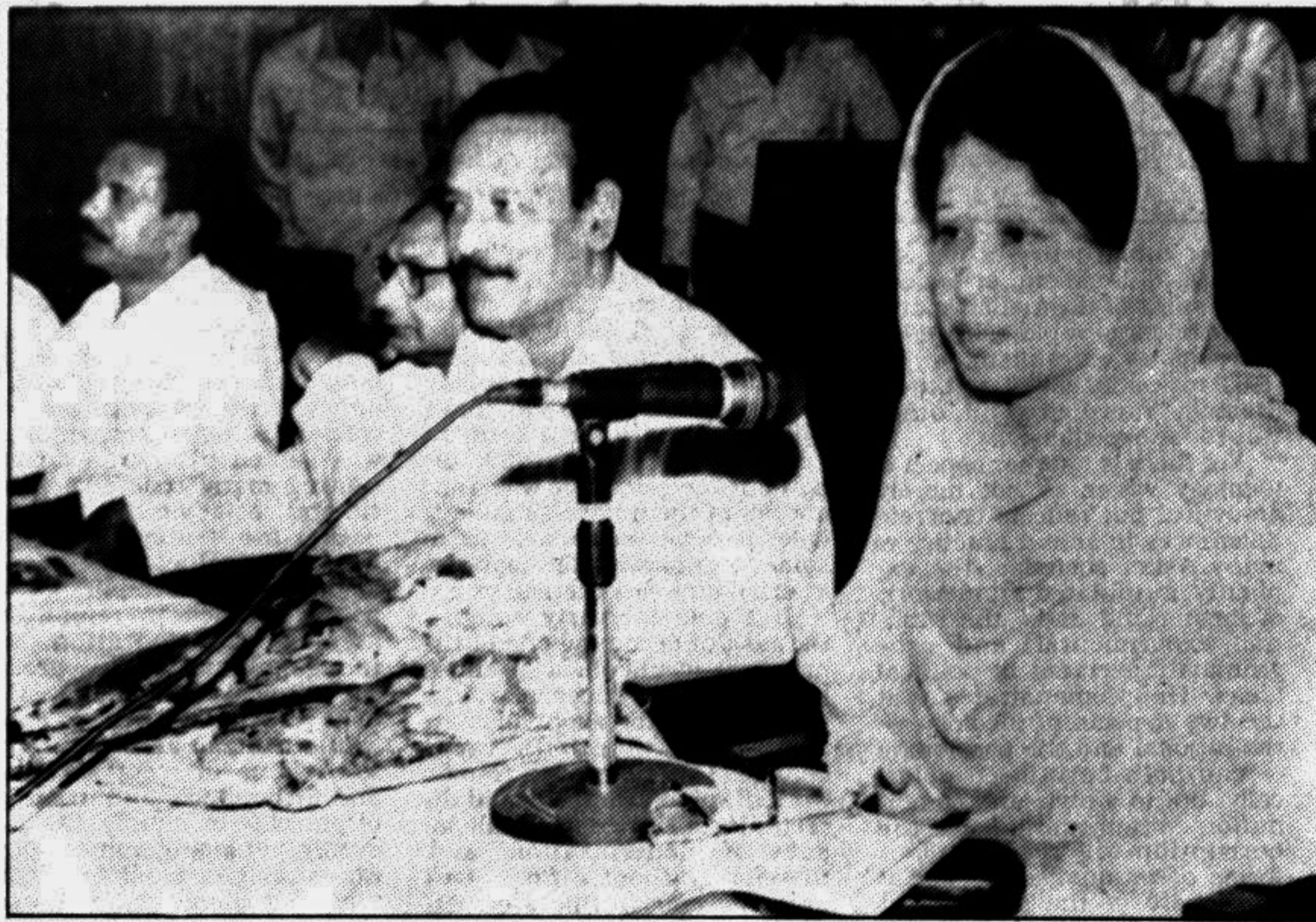
Begum Khaleda Zia, Leader of the Opposition and BNP Chairperson, addressing the 19th founding anniversary of the Jatiyatabadi Jubo Dal at the Engineers' institution yesterday.

(Any phone call or lobbying would be considered as disqualification)