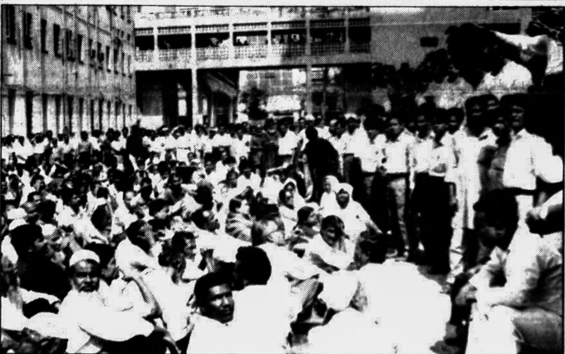
Government employees held a rally inside the Secretariat yesterday demanding revision of the new pay scale.