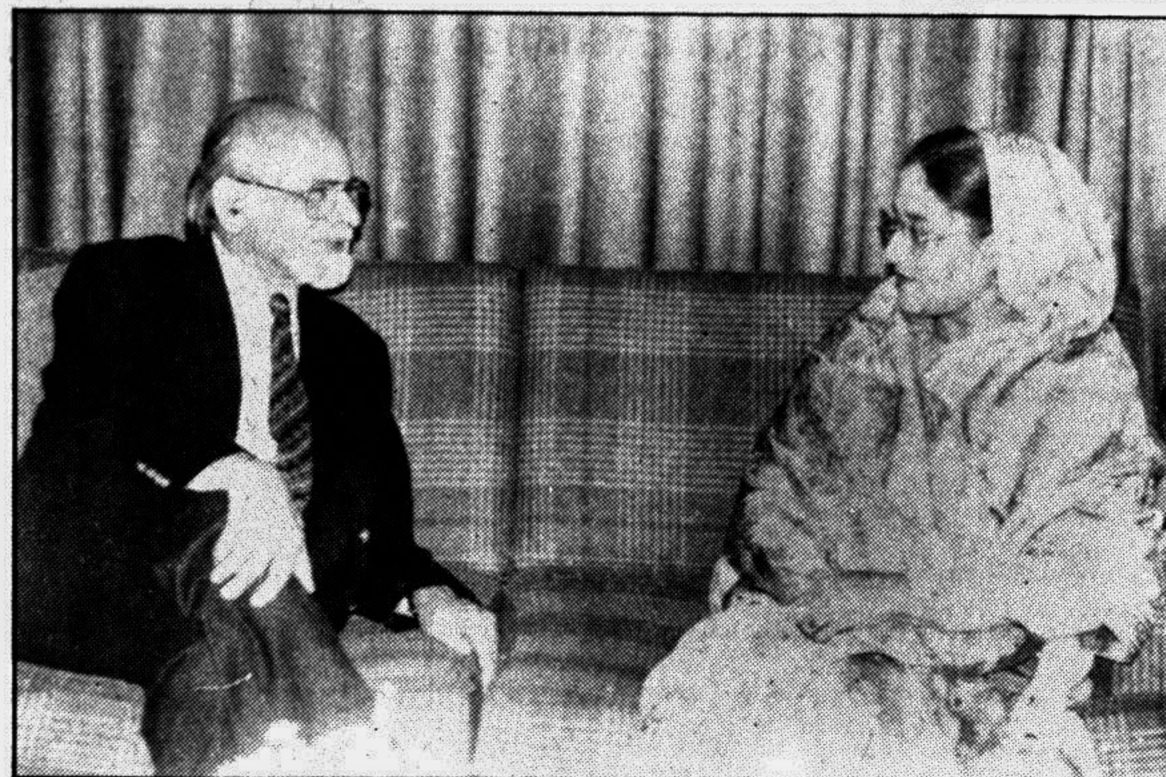
Prime Minister Sheikh Hasina and her Indian counterpart IK Gujral had a meeting in Edinburgh on Sunday.

They commended the Commonwealth Parliamentary Association for its work in strengthening the democratic culture and effective parliamentary practices, and its effort to enhance the participa- See Page 12 Col 8