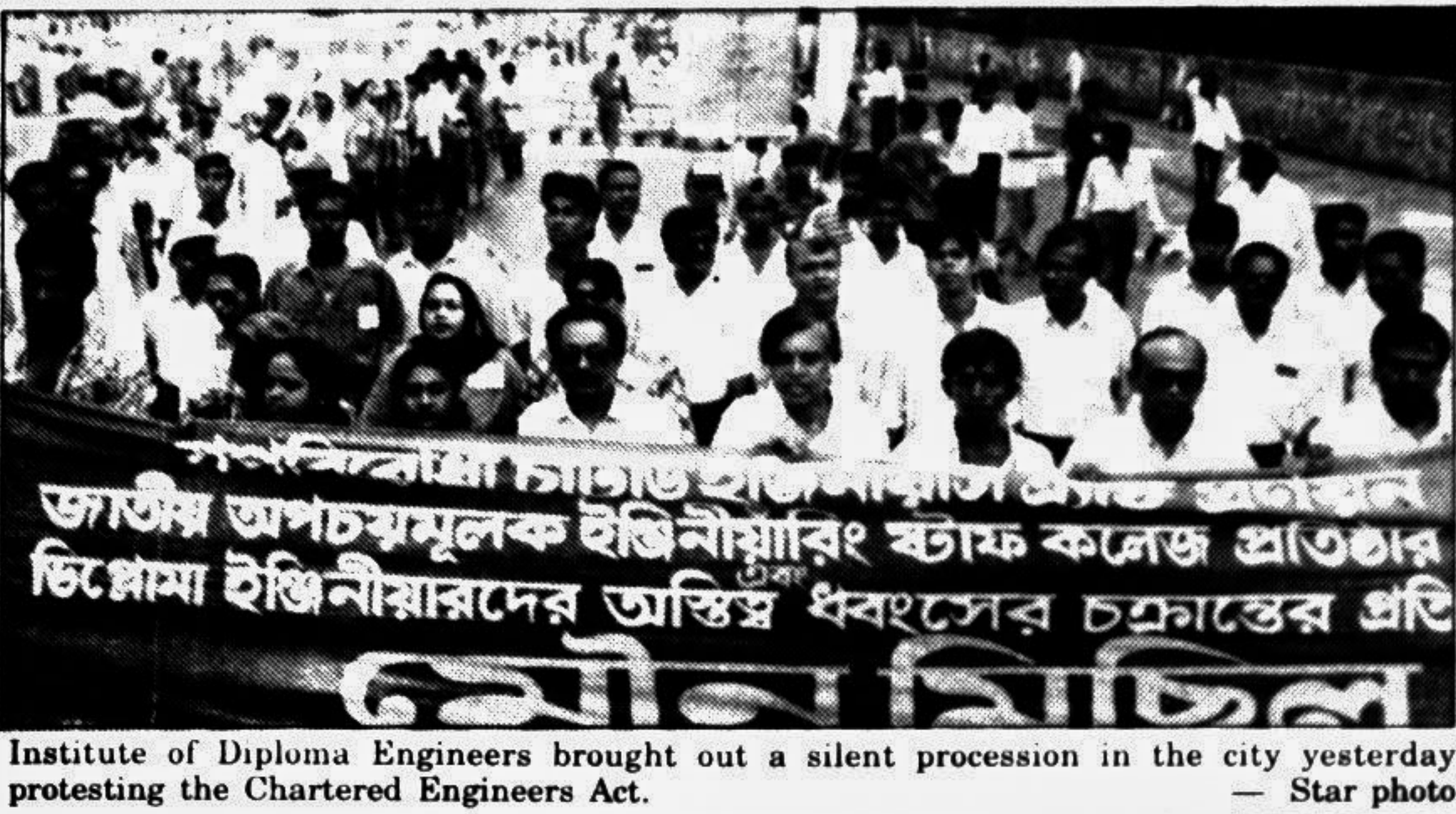
Institute of Diploma Engineers brought out a silent procession in the city yesterday protesting the Chartered Engineers Act.