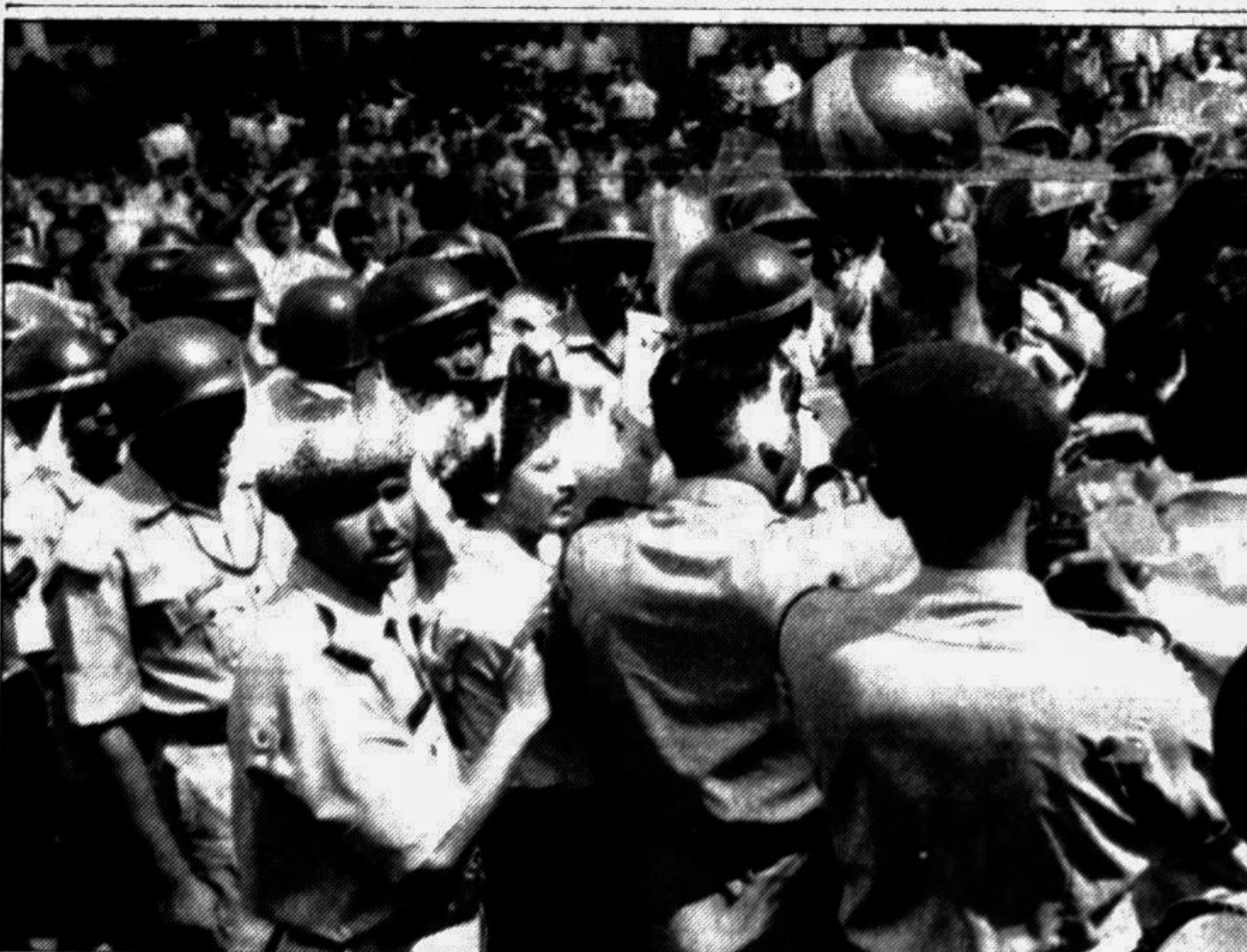
Holding a motorcycle helmet, the OC of Ramna thana trying to keep agitated employees at bay inside the Secretariat yesterday.