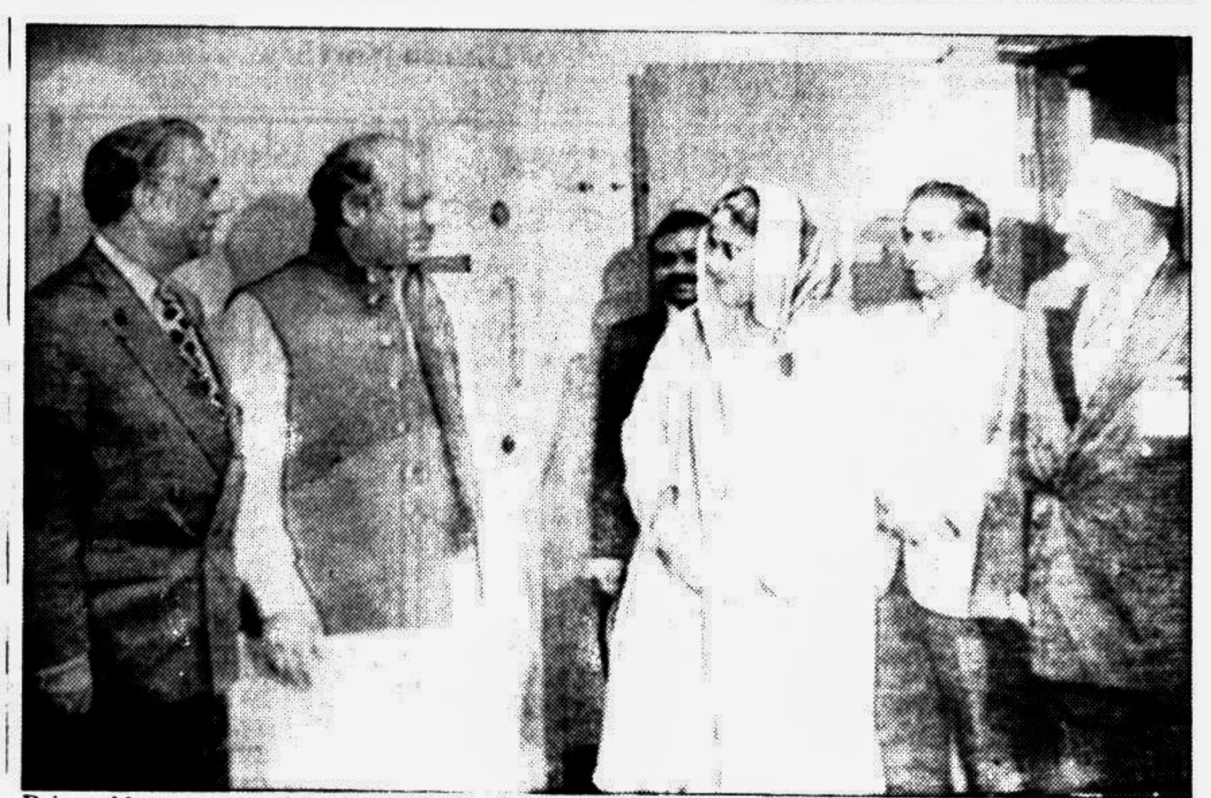
Prime Minister Sheikh Hasina with her Pakistan counterpart Nawaz Sharif prior to their meeting in Edinburgh on Saturday.

From Our Correspondent GAIBANDHA, Oct 25: Railway ferry services between Teestamukh and Bahadurabad ghats from Fulchhari point may collapse at any time following heavy siltation of ferry channel at Kalasona turning point, according to a source in the Railway. Earlier, ferry services had been plying between Fulchhari to Bahadurabad through Propajati channel. On October 15 the said channel was declared abandoned. Later BIWTA opened another northern channel through Kalasona which is more narrow due to heavy siltation. See Page 12 Col 3