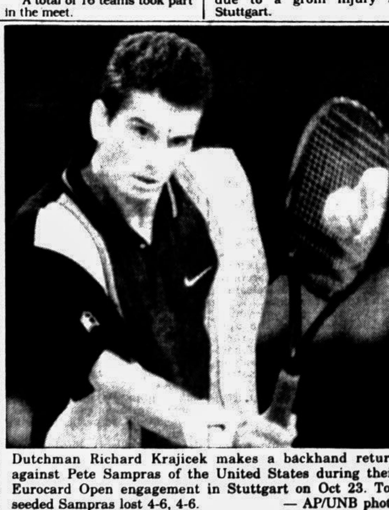
Dutchman Richard Krajicek makes a backhand return against Pete Sampras of the United States during their Eurocard Open engagement in Stuttgart on Oct 23. Top seeded Sampras lost 4-6, 4-6.

Khulna soccer KHULNA, Oct 24: Newsprint Mill clinched the VSA Cup football tournament, title defeating Ulka Club 1-0 in the final at the Khulna Stadium on Wednesday, reports UNB. Health Minister Salahuddin Yusuf witnessed the final and distributed awards. A total of 16 teams took part in the meet.