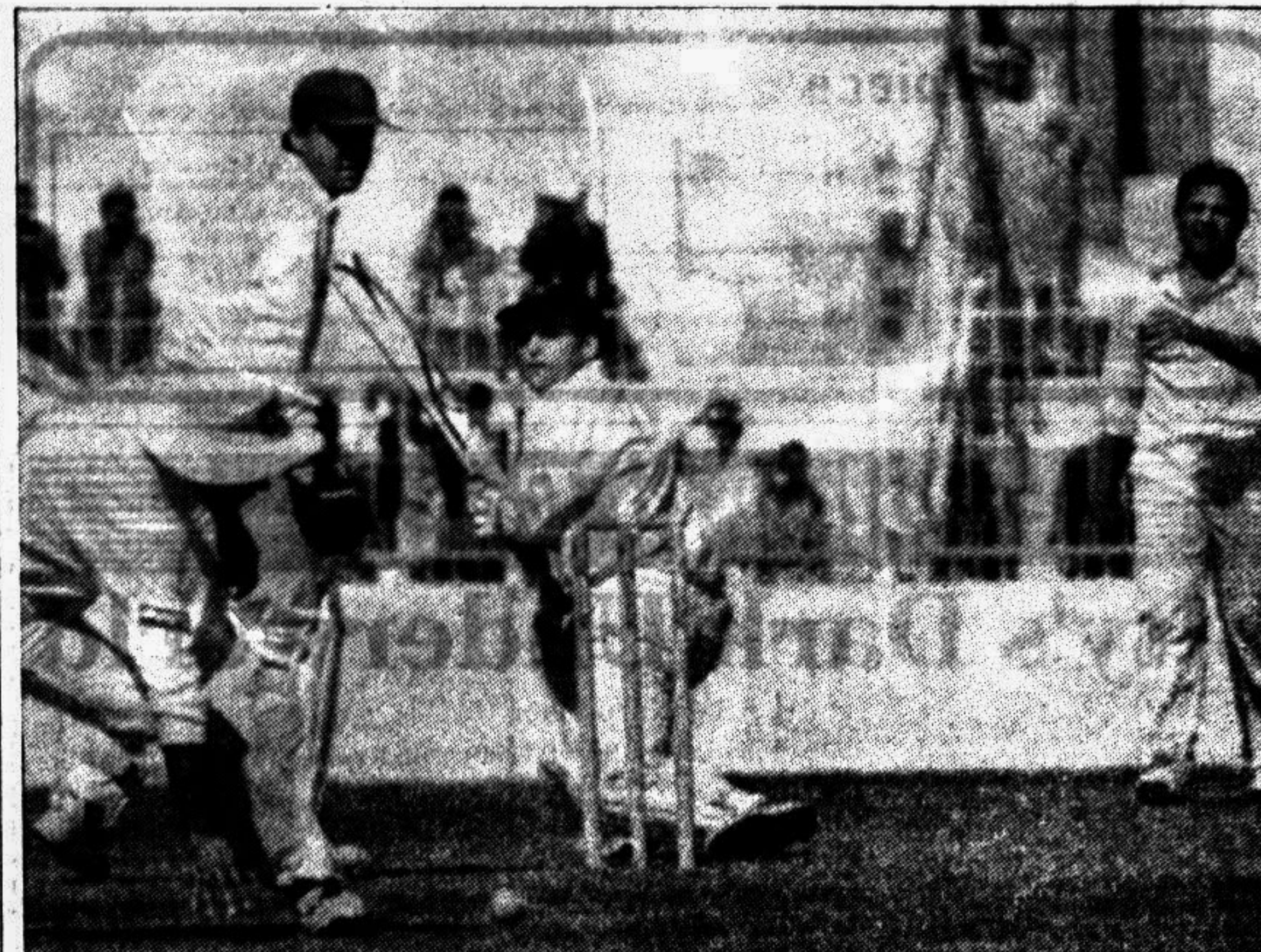
South Africa's Gary Kirsten, who played the pivotal role by scoring a patient 100 not out in his side's first innings total of 239, directs the ball towards the third man boundary during the first day's play of the final Test against Pakistan in Faisalabad yesterday.

Agassi skips Paris Open PARIS, Oct 24: Andre Agassi has turned down a wild card invitation and will not compete at the Paris Open, organizers said Thursday, reports AP. The 2.1 million dollars event begins Monday with Pete Sampras being top-seeded. Agassi was initially given a wild card since his ranking has dropped to No. 102 in the world, which has not qualified him for direct entry into the event. Thursday organizers said in a statement that Agassi decided he was still short of competitive shape, following his early loss at the Stuttgart tournament this week where Todd Martin beat him. Mark Philippoussis of Australia also withdrew because of a sore shoulder. Defending champion Thomas Enqvist is questionable following his default from a match against Patrick Rafter due to a groin injury in Stuttgart.